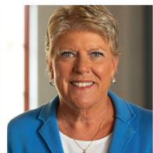
Julia Brownley Congresswoman