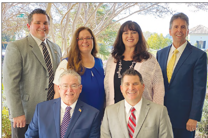
The Barlow Group DRE #01945712

Have your friends call The Barlows, we will find them a perfect Village home!