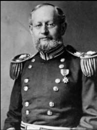
Henry Martyn Robert ( 1837-1923)

“Where there is no law, but every man does what is right in his own eyes, there is the least of real liberty.”