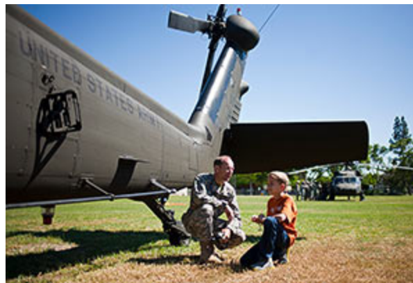
Black Hawk helicopters on campus

MEDIA PARKING: Lot K. Enter at Campus Drive from Barstow, east of Cedar.