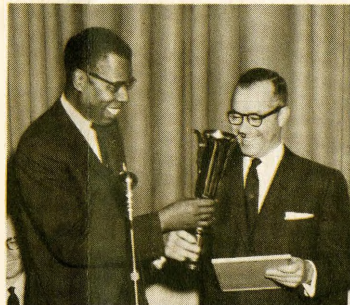
honored for defense of human rights