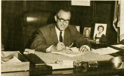
nearly 500 criminal prosecutions always pending; 90% successful