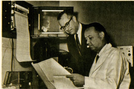
one of the nation's newest and finest crime labs