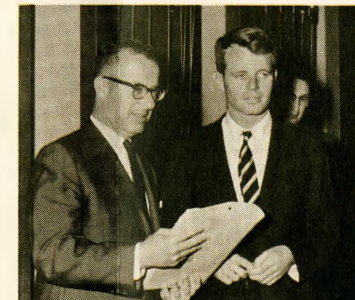
works closely with nation's top law men