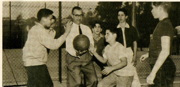
vitaly interested in youth activities

The Attorney General must see that the laws of California and their enforcement are adapted to meet the changing needs of this fastest growing state. He personally visits cities and towns throughout California to discuss problems of law enforcement and methods of crime prevention with peace officers and civic groups. In addition to regular meetings with peace officers, Attorney General Mosk initiated California's first state-wide crime prevention conference.