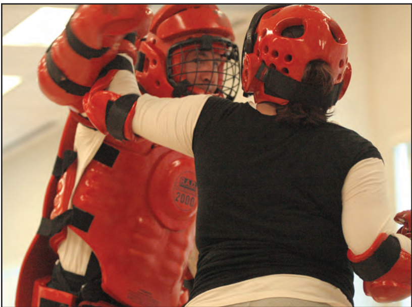
The RAD course is offered to help women protect themselves.

If you are a woman and want to learn realistic defensive tactics, then sign up for Rape Aggression Defense. The next course schedule will be Oct. 23, 24 and 25. This is a three-day course. RAD, Rape Aggression Defense is a national program of realistic self-defense tactics and techniques taught specifically for women. Regardless of your physical condition, RAD is designed to help women defend themselves against being victimized. Despite your ability, age, experience and strength, this three-day class will provide effective martial art training that can be