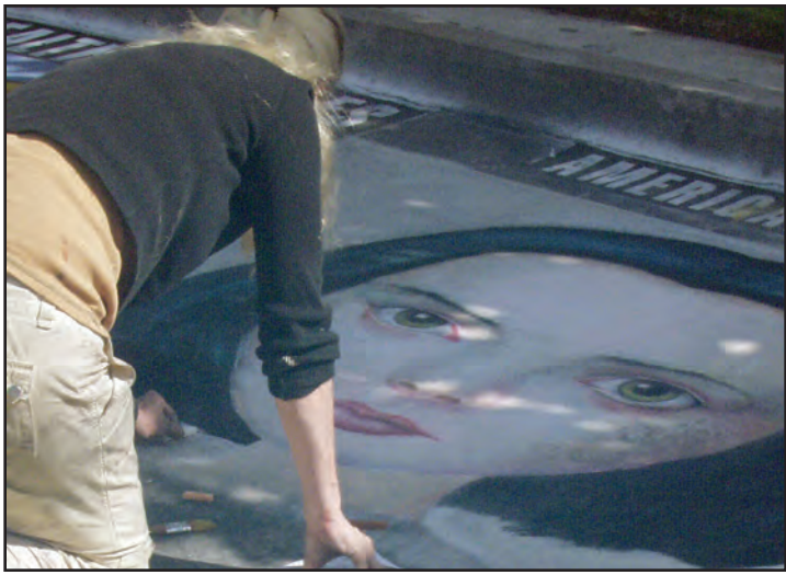
Via Arté gave Bakersfield the opportunity to show its creative side. Story on Page 4.