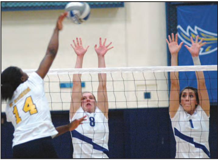
Women's Volleyball took on UC Riverside. Story on Page 6.