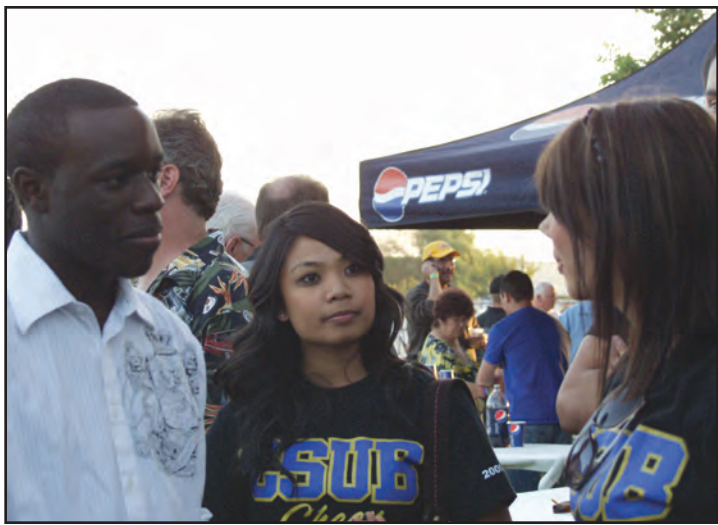
The Athletic's Fall Barbecue brought students, faculty, athletes and the community together. Story on Page 4.