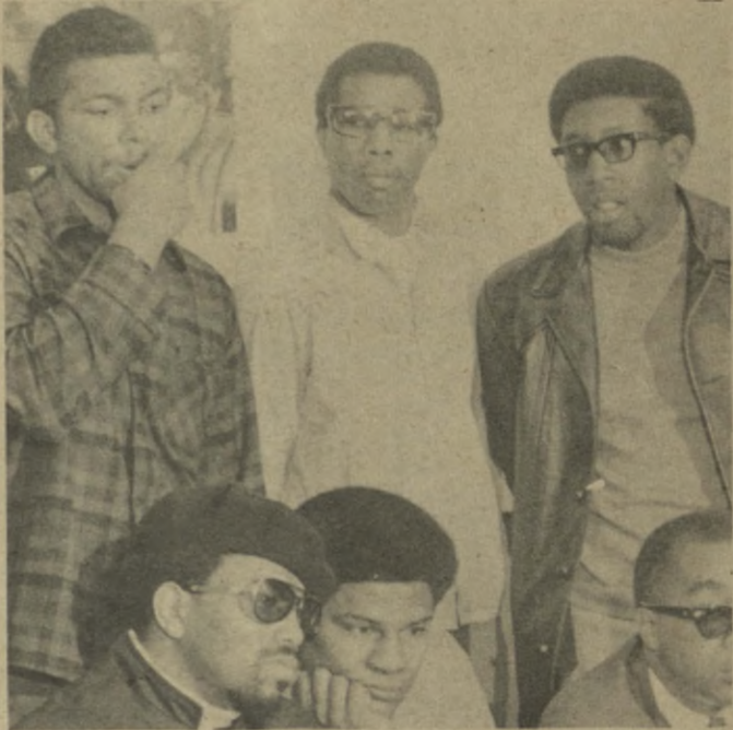
Black spokesmen list strike demands

The trustees and the administration are preparing to destroy us.