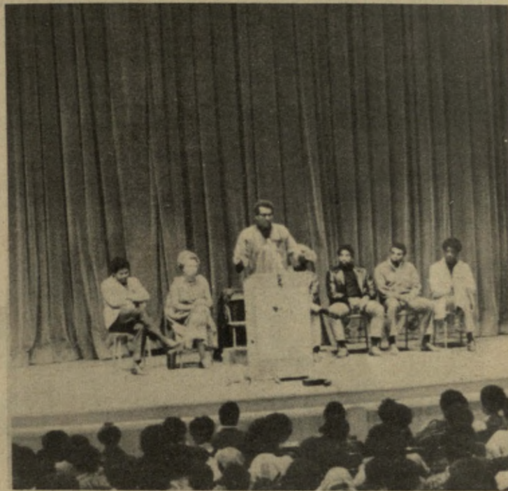
Stokely Carmichael addresses Third World audience

er, black people "must heighten the contradictions in preparing for the confrontation."