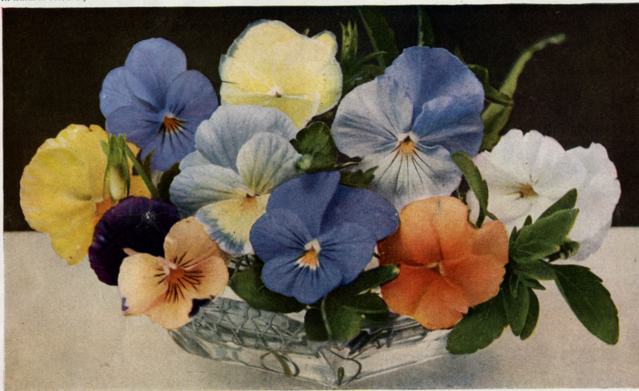
SUTTON'S BEDDING VIOLAS.

Violas are indispensable for spring gardening, and if the dead blooms are regularly removed the plants will continue to flower profusely until late in autumn. This valuable perennial plant is perfectly hardy, and may be grown in the same manner as Pansy. Height 6 inches. (Illustrated below in natural colours.)