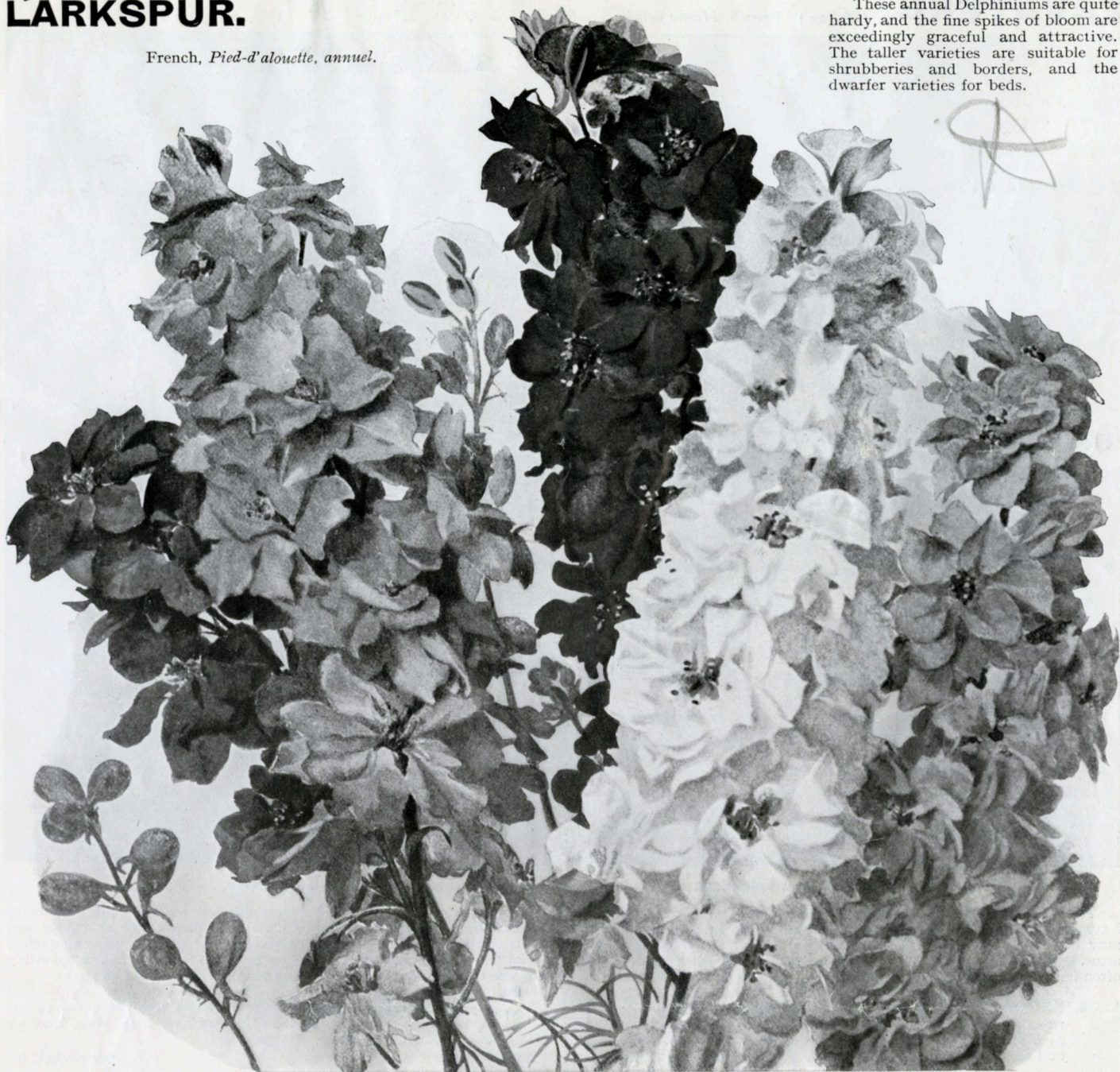
Sutton's Stock-flowered Larkspurs.

These annual Delphiniums are quite hardy, and the fine spikes of bloom are exceedingly graceful and attractive. The taller varieties are suitable for shrubberies and borders, and the dwarf varieties for beds.