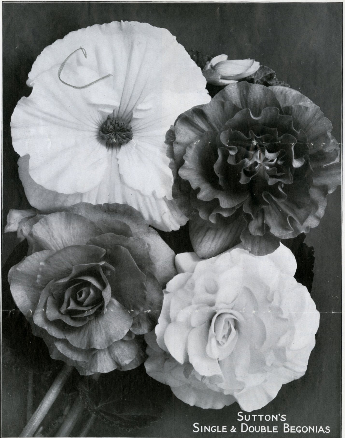
SUTTON'S SINGLE & DOUBLE BEGONIAS