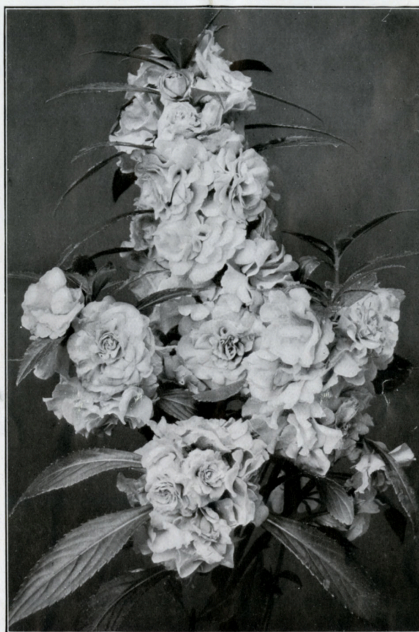
Sutton's Improved Camellia-flowered Balsam.