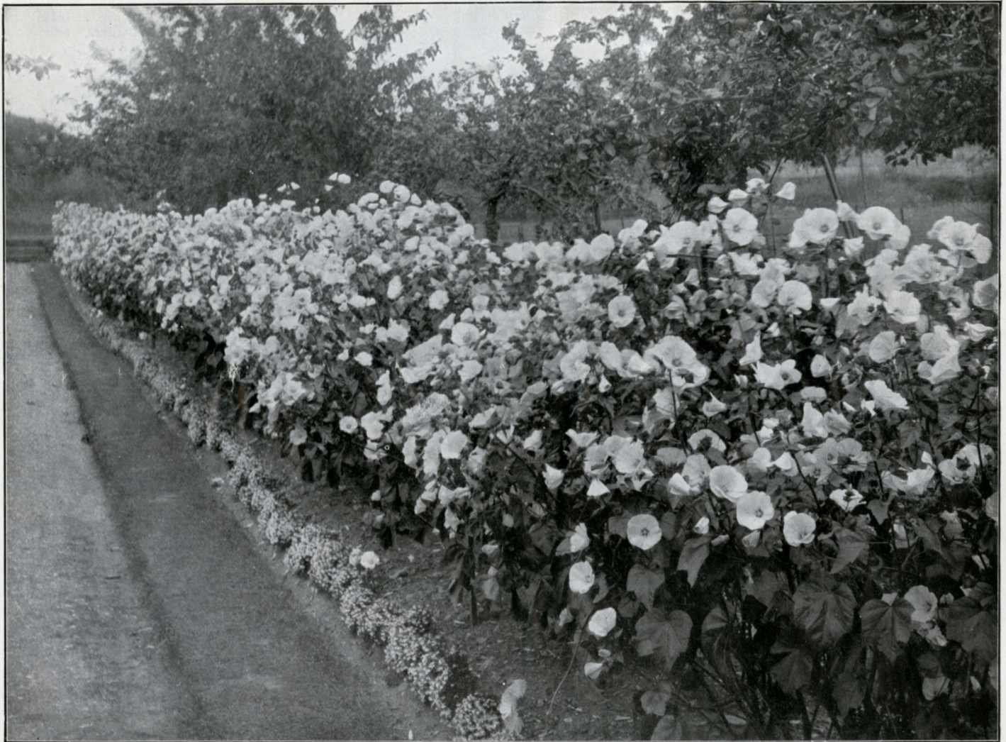
Lavatera rosea splendens makes a splendid 'hedge' plant for the flower garden.