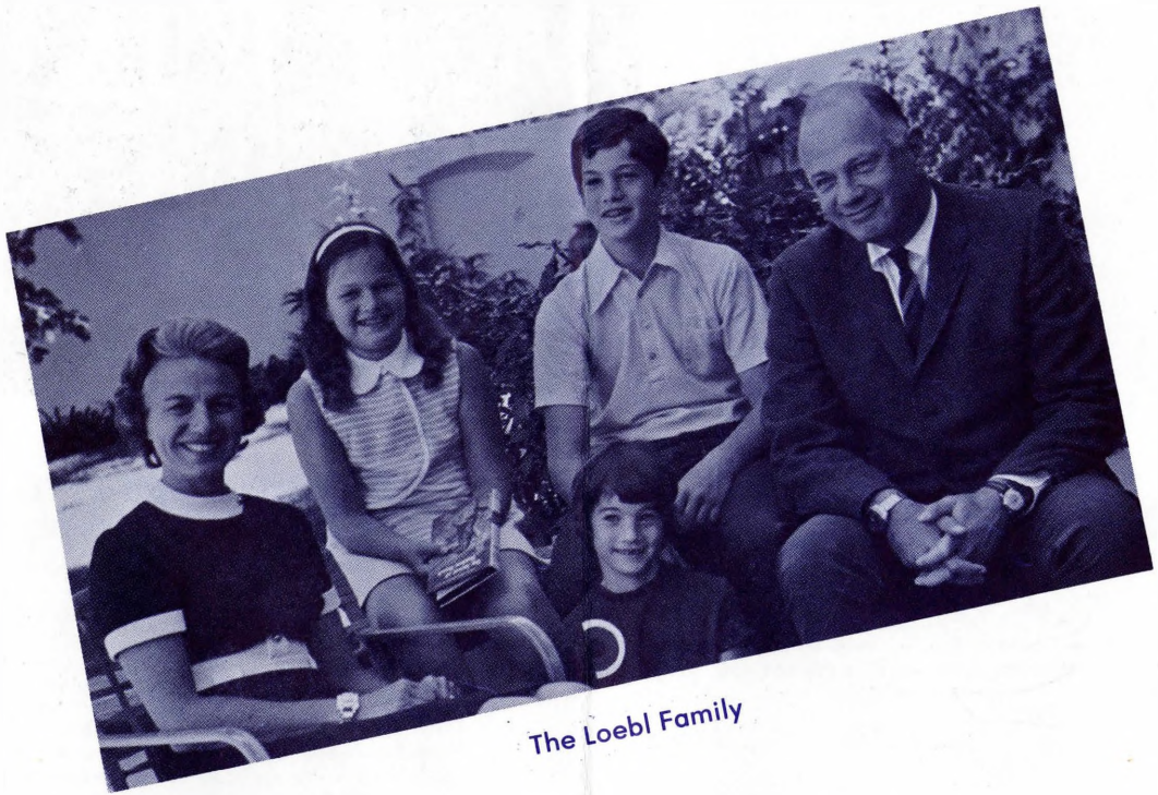
The Loebel Family

"The first priority of our federal government must be to achieve a fuller, richer, more productive national economy to better the lives of all of our citizens.