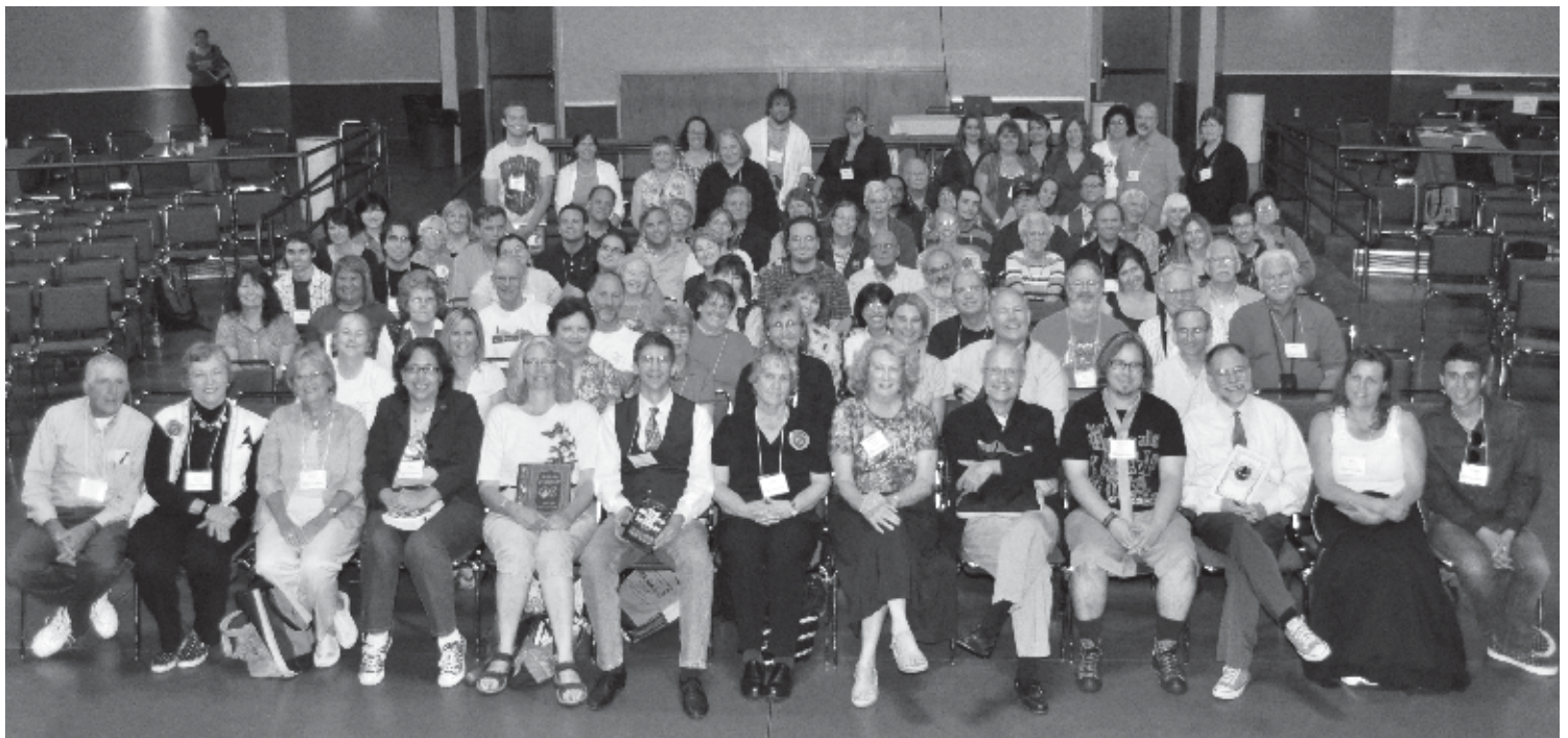
Laughing the day away: Oz Conference attendees and speakers.