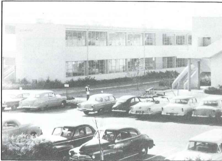
The science building on the new Fresno State campus, McLane Hall, was named after Charles L. McLane. The view looks west from the agriculture building (circa 1959).