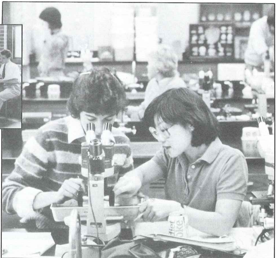
A biology laboratory class shows students using powerful compound light microscopes. Today, women are more evident in science classes, which were once dominated by male students.