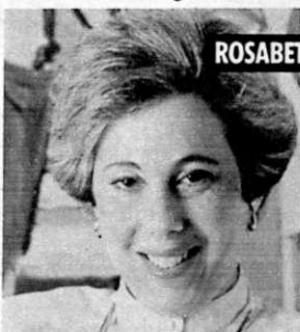
ROSABETH MOSS KANTER