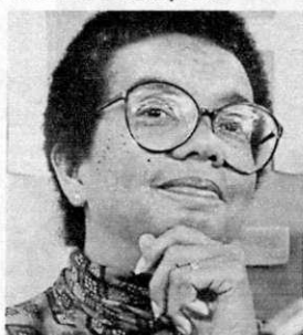
MARIAN WRIGHT EDELMAN