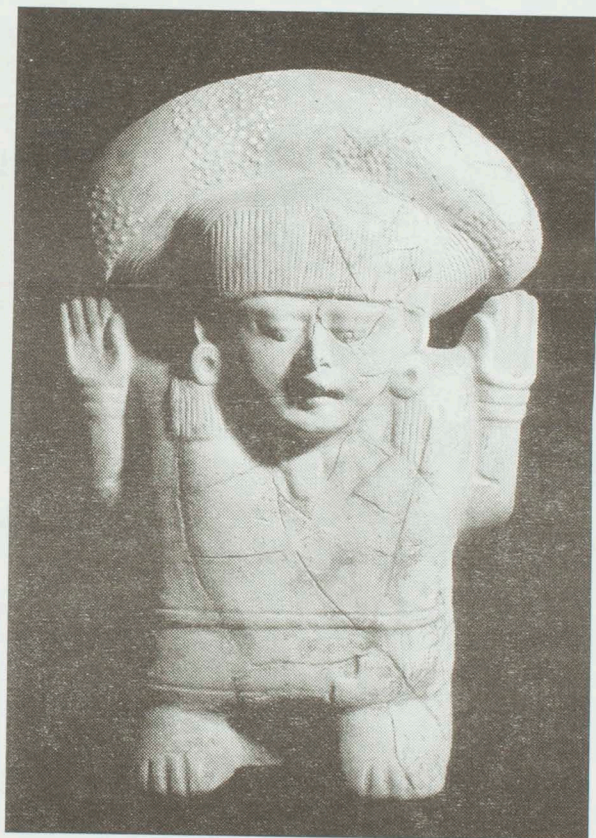
Nopiloa Figure, Veracruz (late classic), Kenneth E. Stratton collection

Ancient clay sculpture from what is known today as Central Mexico comprises this exhibition drawn from the Kenneth E. Stratton Collection. All of the sculpture on display was made before the Europeans entered the New World. The exhibit presents 108 objects representing fourteen cultures which date from 500 to 2,500 years in age. The peoples of Mesoamerica had diverse pantheons with an almost bewildering number of deities. These gods and goddesses were associated with natural phenomena with emphasis given to the earth, celestial bodies, fire and water. As