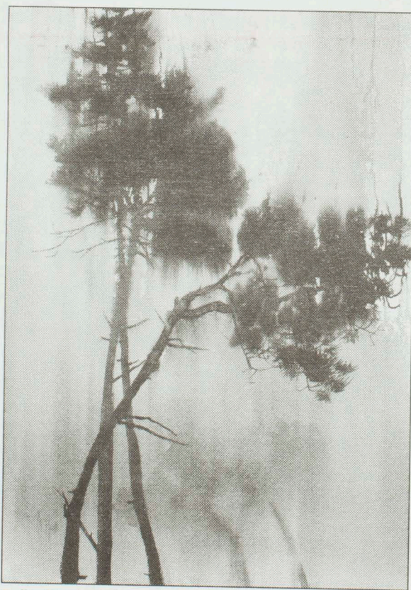
Rollin Pickford, Bowed Pine , Watercolor on paper, 1975.

in Residence in the Museum's Childspace Gallery. He was active in the founding of the Fresno Art Center (now the Fresno Art Museum) and the informal group of Fresno watercolorists known as "The Tuesday Group." The current exhibition coincides with the publication of a full color, hard bound book of Pickford's work by The Press at California State University Fresno.