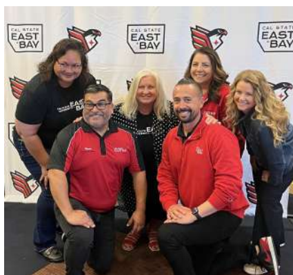
Leadership Team at SAEM Awards Breakfast