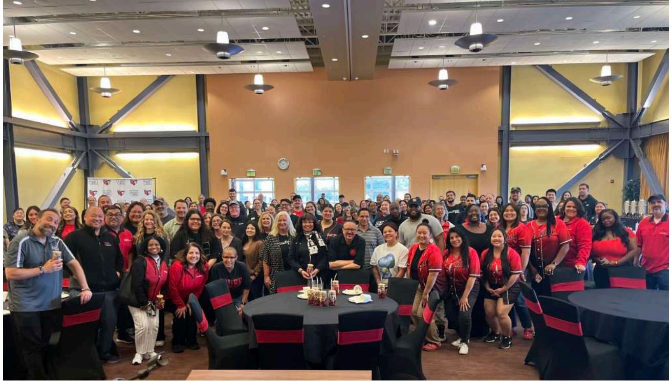
Student Affairs & Enrollment Management Awards Breakfast