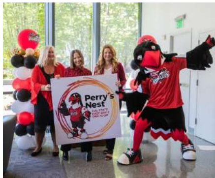
Perry's Nest name reveal