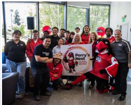
Student ambassadors at the name reveal