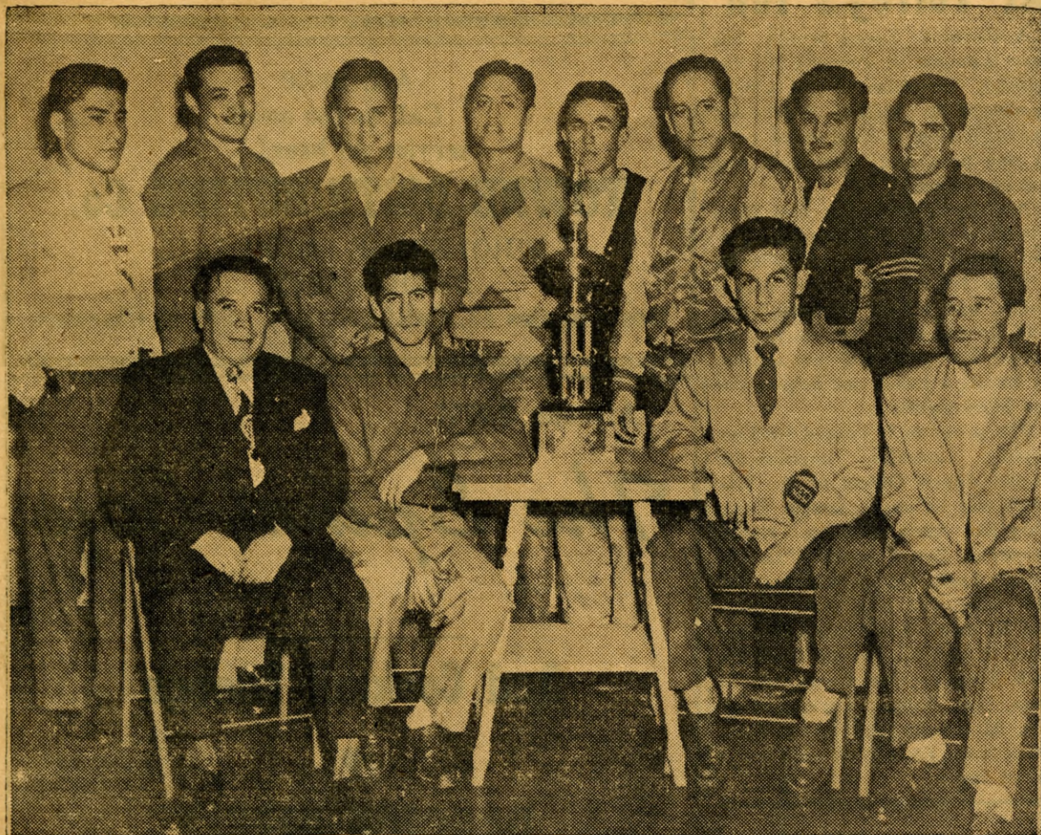
"LA OPINION" TROPHY—(Pictured above is the basketball trophy which was donated by the Mexican Daily "LA OPINION" to the Mexican Athletic Union to be awarded to the champions of the M. A. U.'s Basketball Tournament. Surrounding the

This year it is very important that you send in your All Latin eleven as the Mexican Athletic Union and the SPORT PAGE are cooperating to stage a football banquet at one of the local night spots. Winners of the first team will receive a gold football donat- (Continued on page 8)