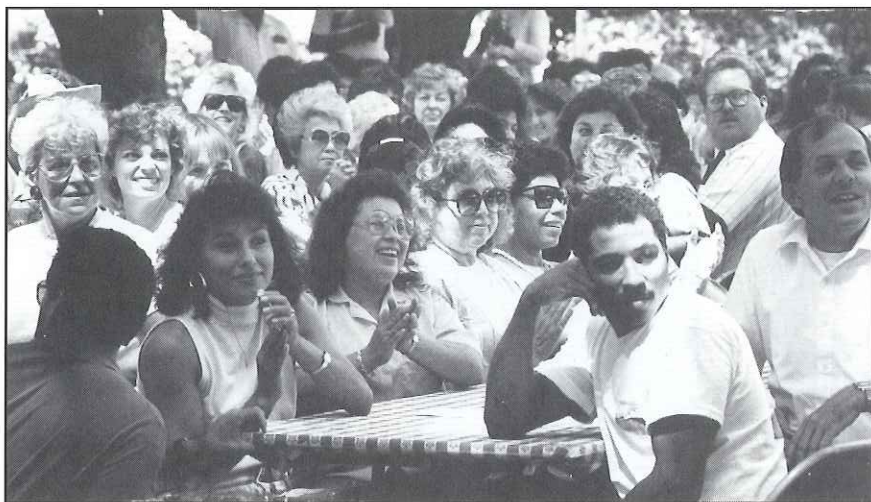
At the Fall Kick-Off Assembly, members of the university community turned their attention to a performance of country-western music after a hearty barbecue treat.

Many view the Assembly as an avenue for meeting other people who work on campus. But the blessings of Staff Assembly-related activities are not reaped by members alone. Better working relationships do create a more pleasant and productive environment for everyone, benefiting faculty members and students in the end.