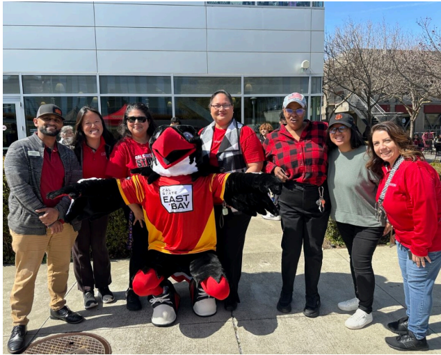
March Block Party