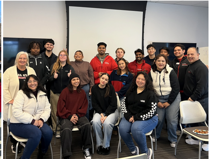
Welcome Center Ambassadors Orientation

Interim Vice President, Student Affairs & Enrollment Management.