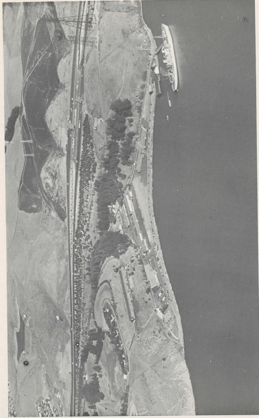
AERIAL VIEW OF THE CALIFORNIA MARITIME ACADEMY CAMPUS AND TRAINING SHIP "GOLDEN BEAR"