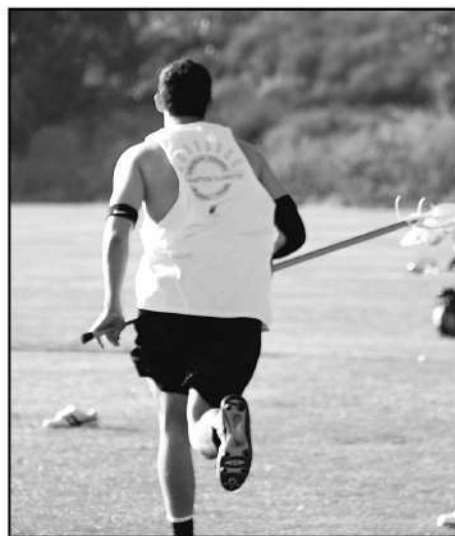
Up-Coming Issues - Lacrosse: Hot New Club Sport