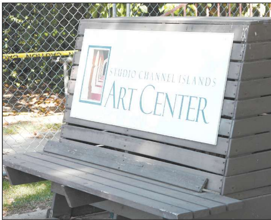
Familiar Studio Channel Islands bench soon to say goodbye to campus.