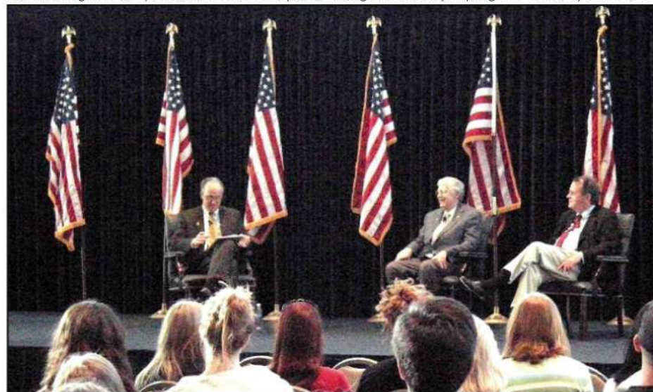
Former congressmen speak to CI students as part of Congress to Campus program

So what is the message the two former members of Congress want to give us as students? Participate. Care enough about your country to vote. Every vote makes a difference. Secondly, be informed. Know who represents you and if you are not happy with how you are being represented, vote! The future of the country lies not in the hands of those members of Congress, but in the hands of the citizens who put them there. The right to vote is one of the greatest rights we can have as United States citizens. So...exercise that right!