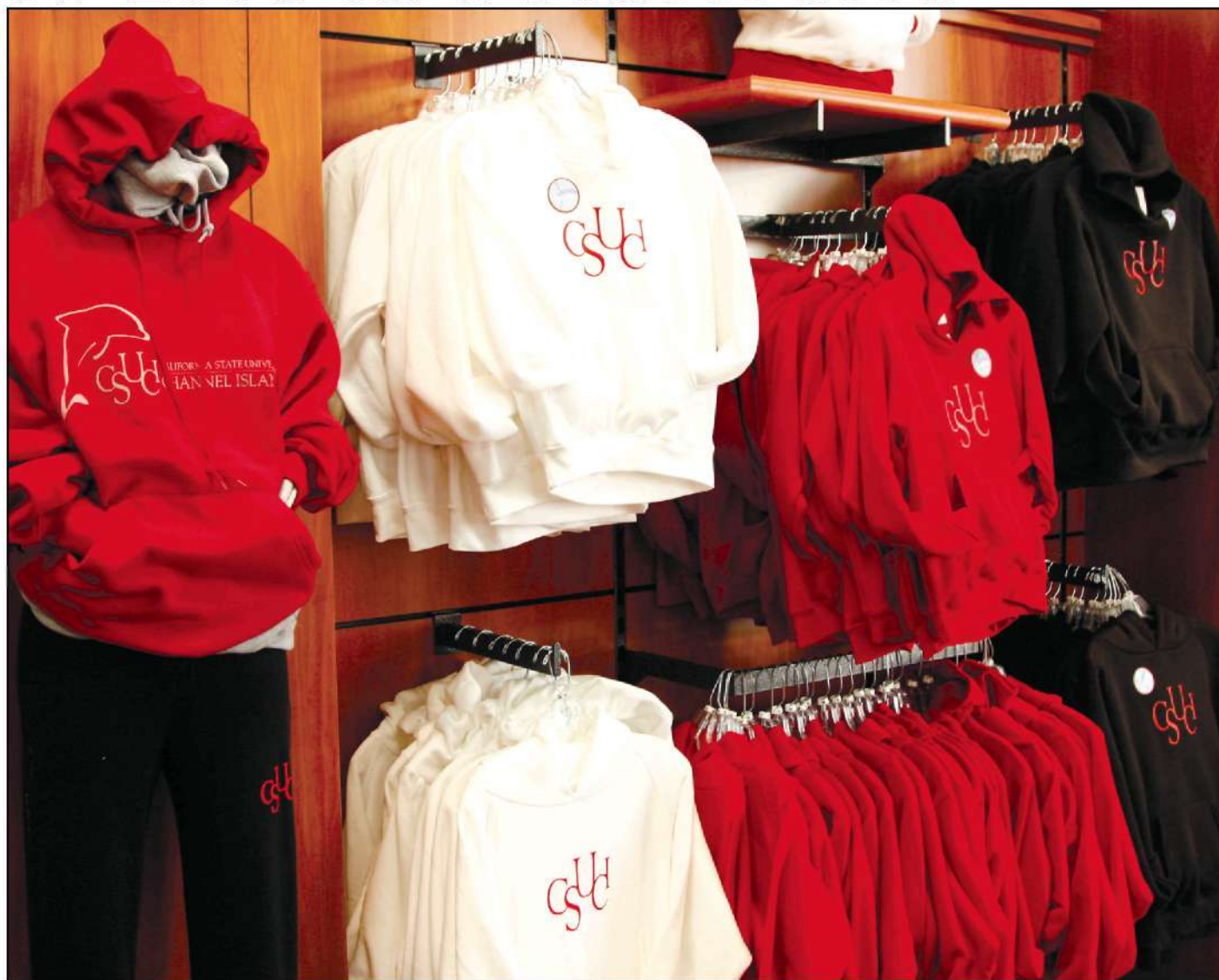
Current CSUCI Logo shown above on Cove Bookstore merchandise.