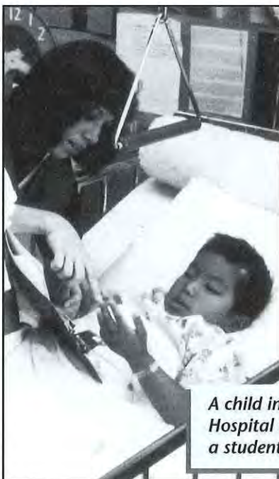
A child in Valley Children's Hospital receives a visit from a student volunteer.

Before you leave this university, make a connection with Students for Community Service (SCS) and make a positive difference in someone's life.