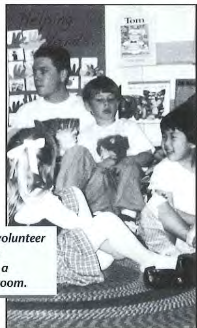
A student volunteer works with children in a local classroom.