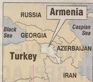
THE FRESNO BEE

The scholarships could prove particularly enticing in regions like the San Joaquin Valley, home to tens of thousands of Armen-