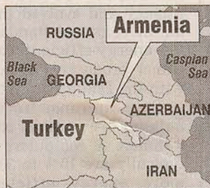
THE FRESNO BEE

ward normalized relations, landlocked Armenia is eager for a reopening of the border and the trade opportunities it would bring. The border was closed after Armenian forces took control of the Azerbaijan region of Nagorno-Karabakh. The Turkish population shares close cultural and linguistic relations with Azerbaijan, which is pressing Turkey for help in recovering its land.