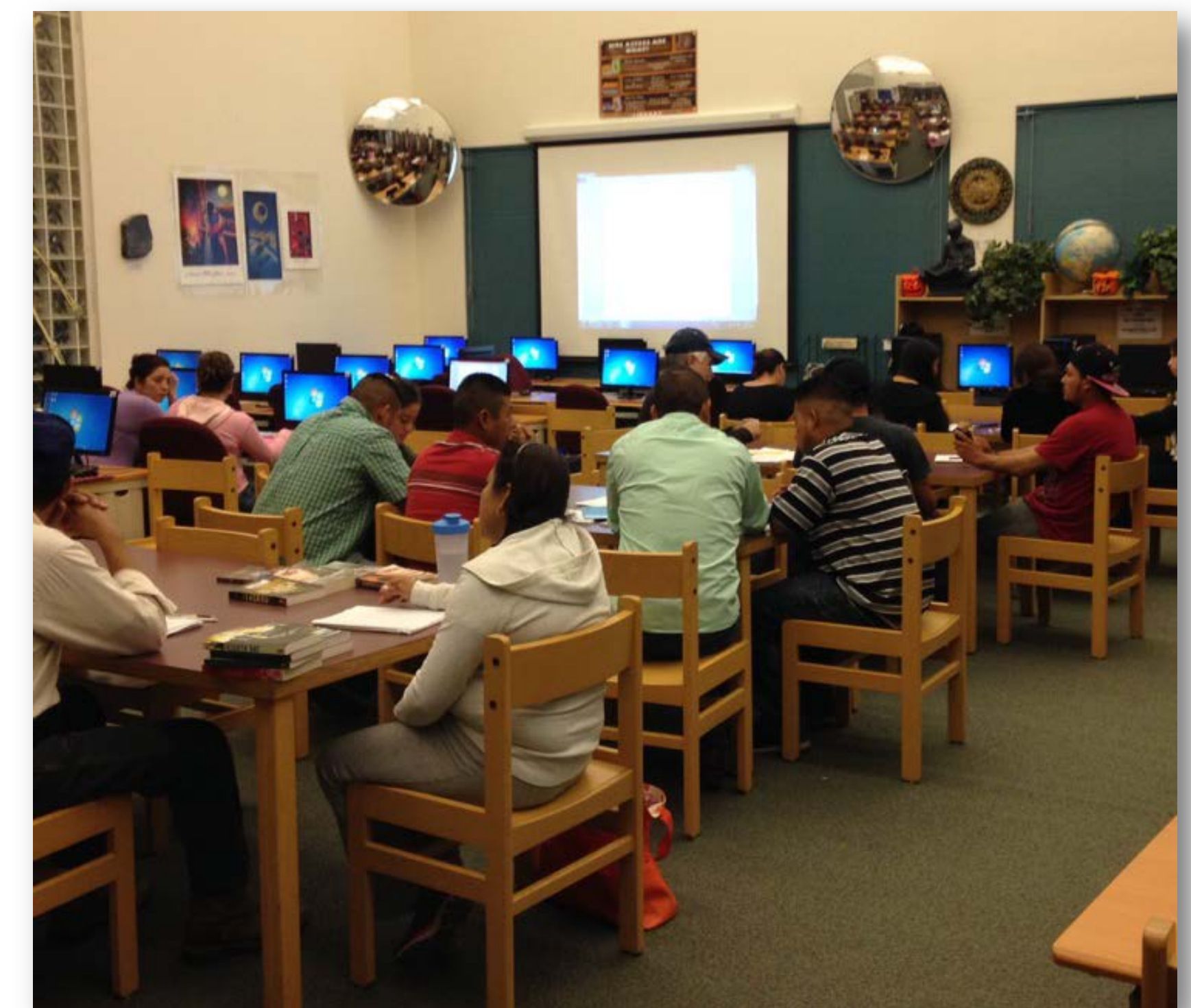
Parent University provided services to 18 school sites during the Spring 2016 Semester.