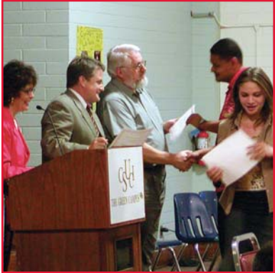
Oxnard Students Get Taste of University Life