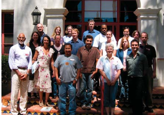
New faculty members pose for a group photo in the Bell Tower Courtyard.