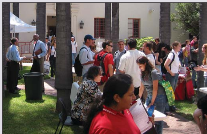
Pizza, henna tattoos, and new friends await the new freshmen on the first day of class.

And the plan appears to have worked. “I was kind of