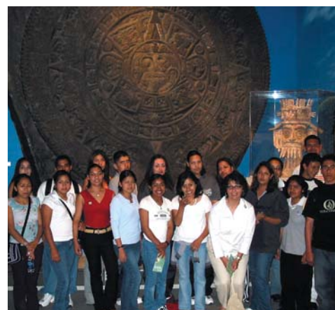
Summer College students enjoy a field trip to the Natural History Museum as part of their anthropology course.