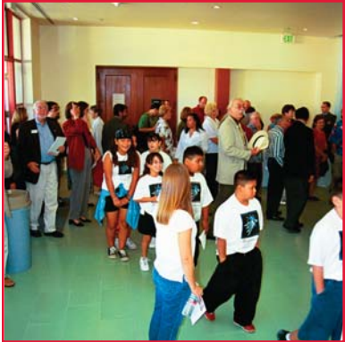
Elementary School Kids Are First Inside New Science Building