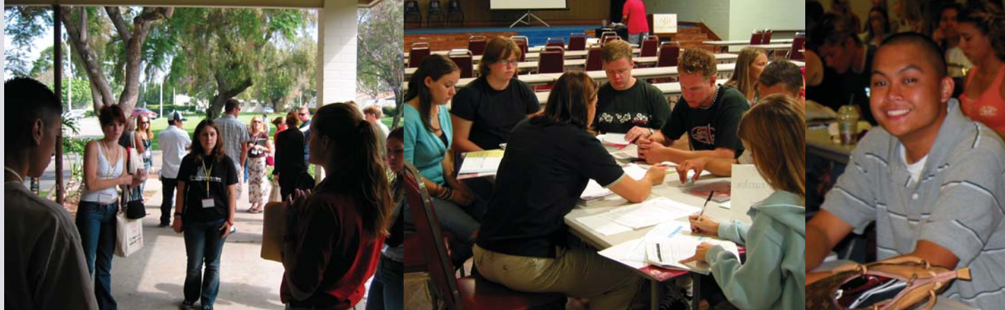
New faces on campus