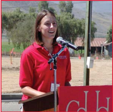
Campus Community Celebrates New Student Housing Project