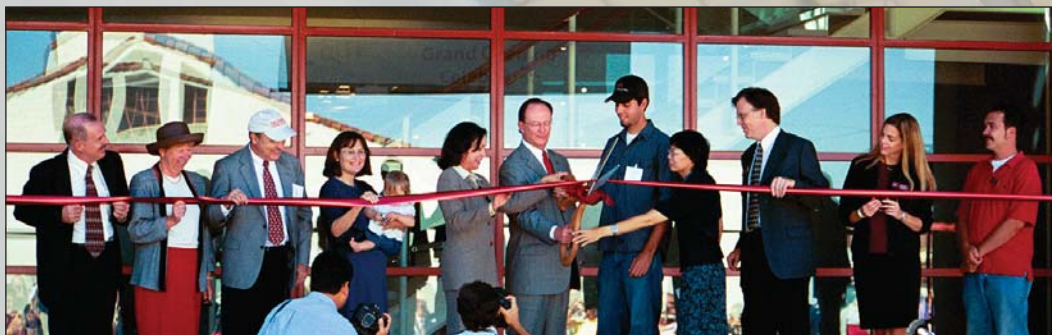
New Science Building

The $12 million Science Building both crowns a successful first year and will set the standard for the many campus developments to come.