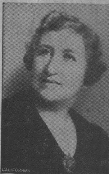
CALIFORNIA