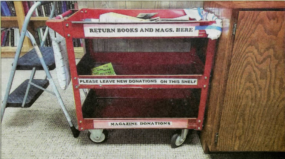
THE OLD RED CART