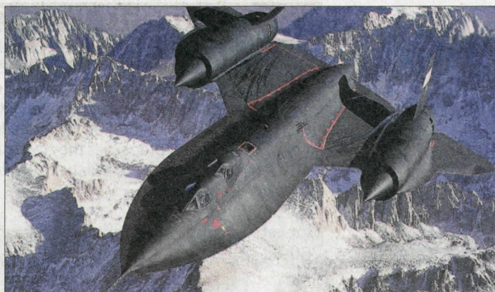
The SR-71 Blackbird, in flight, photo taken from the refueling tanker.

The first SR-71 was tested at night in Palmdale in December 1964 and delivered to the Air Force in 1966. It could soar 85,000 feet and achieve a