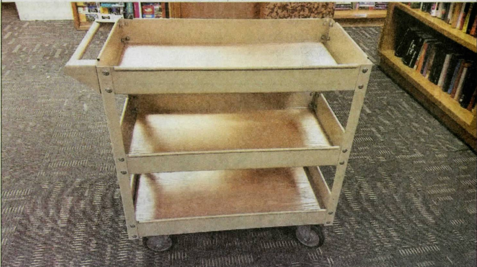
THE UPDATED REPAIRED CART