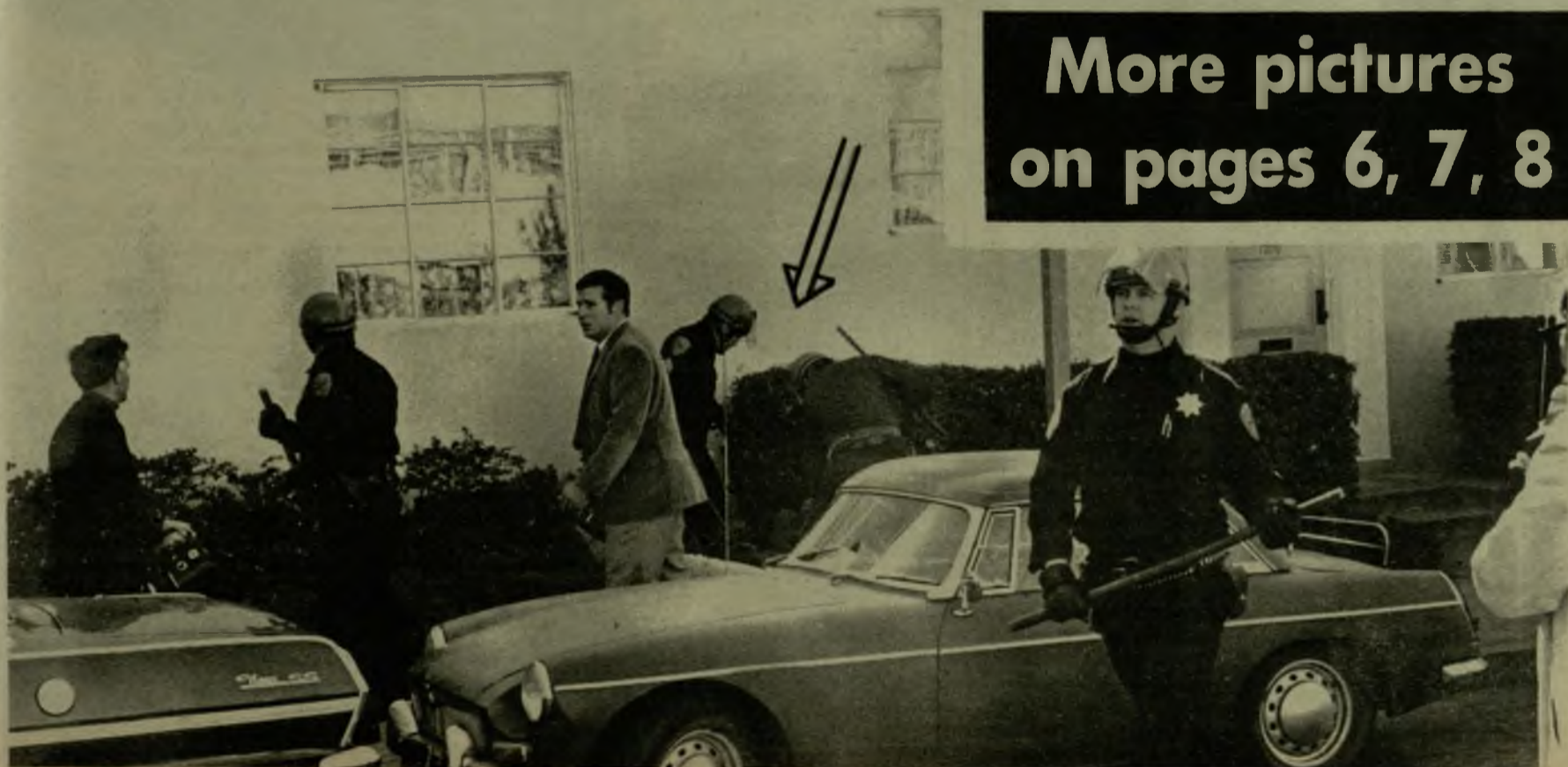
SF Tactical Squad policeman was caught with billy club raised high over the grounded body of an