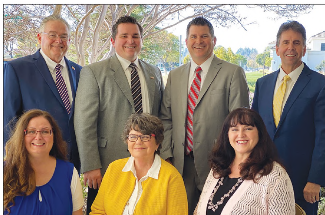
The Barlow Group DRE #01945712

THE BARLOWS ARE PROVEN EXPERTS IN LEISURE VILLAGE! WE'D LOVE TO TELL YOU WHY WE BELIEVE WE'RE YOUR BEST CHOICE IN LEISURE VILLAGE!