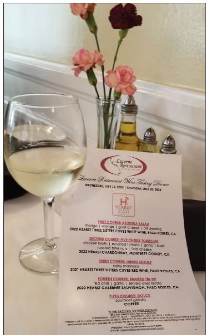
Table setting and menu at a recent wine dinner regularly scheduled at Lucerne Restaurant.

We enjoy the wine tasting dinners regularly offered at several local restaurants. These fixed price dinners have a set menu geared to match the wines, usually from one winery. Each course is served to everyone at the same time and crafted to match the wine served with it. Ideally, the wine complements the food so that the combined palate is delightful, leaving you wanting more of both.