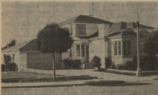
DREAM HOUSE —At a cost of $80,000 the Ecumenical Council purchased this off-campus center for use by six Protestant denominations.

The committee hopes to organize similar projects at the City College of San Francisco, the University of California's Medical Center and Hasting's Law School as part of San Francisco Christian Centers, Inc.