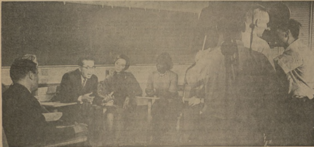
Dr. S. I. Hayakawa's semantics seminar discuss communication before NBC cameras.