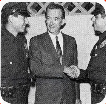
Working closely with Law Enforcement Officers keeps the Attorney General in close touch with local problems.

MOTORCYCLE GROUPS — Led action to stop lawless motorcycle bands from terrorizing communities.