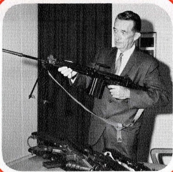
Attorney General Lynch is a strong advocate of legislation to control the sale of firearms for unlawful use.

VIGILANT PROTECTOR The problems of youth are an important concern — the direction of youthful energies and enthusiasms toward constructive pursuits — the development of proper respect for the law in our future citizens.