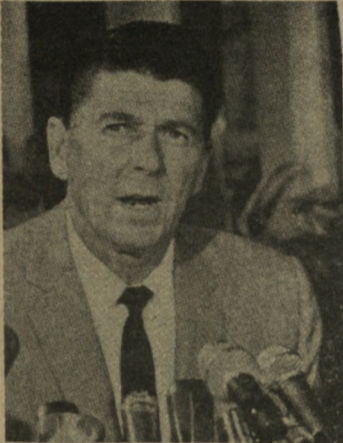
RONALD REAGAN California's favorite son?