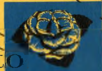
CAMELLIA CAPITAL OF THE WORLD!