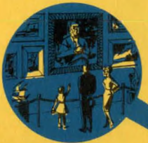
CROCKER ART GALLERY