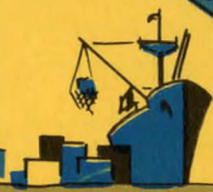
PORT OF SACRAMENTO