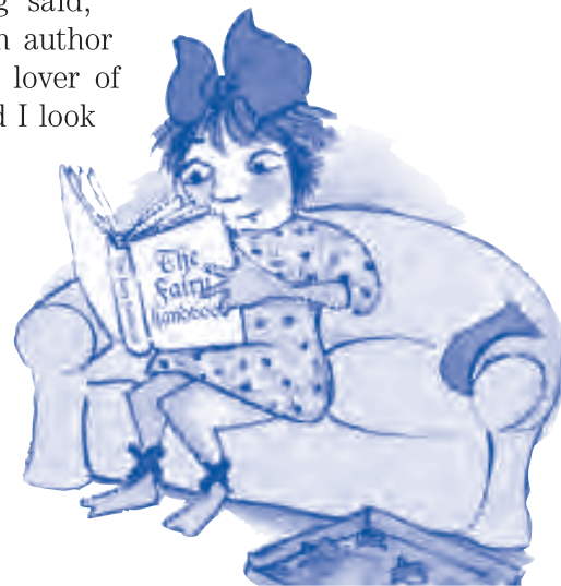
Pish and Posh

Attending conferences and exhibits sponsored by the Arne Nixon Center and ANCA has been exhilarating. My nametag at the Society of Children's Book Writers and Illustrators meeting said, "Other." I am not an author or illustrator, but a lover of children's books and I look forward to sharing my passion with all of you.