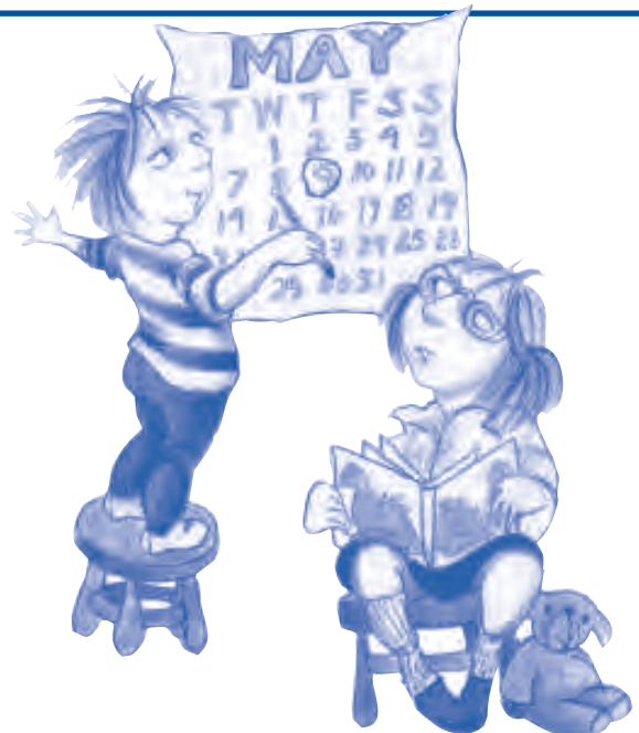
Big Boss! Little Boss!

Shine! Youth Theatre's traveling production of “Alice in Wonderland,” Madden Library