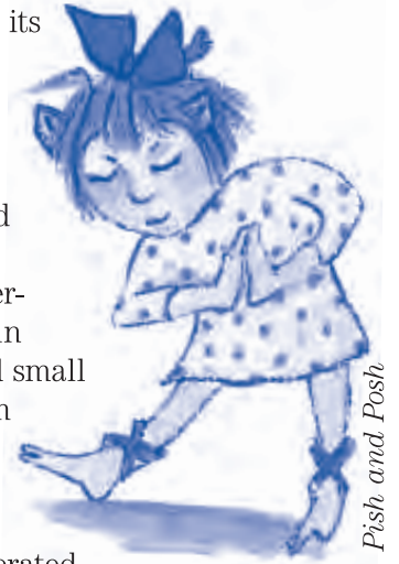
Pish and Posh