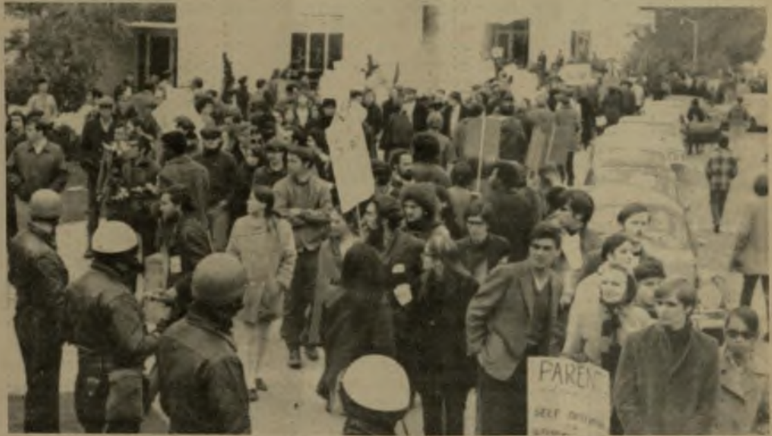
Police lines shadow picket lines

"Things have slacked off today," Hensil said. Reviewing the results of midday demonstrations in December, he