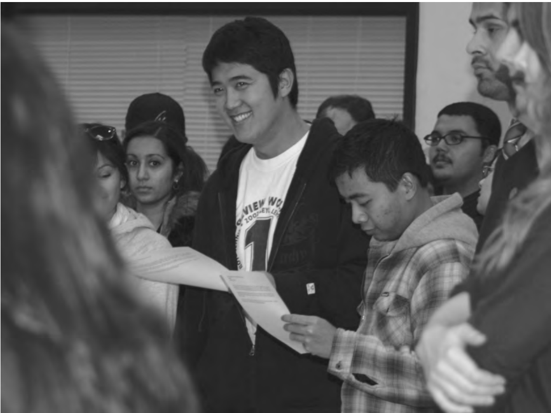
Students that were in attendance were asked to give their input on how budget cuts are affecting them.

Post-its were placed on walls to inform attendees on facts regarding the problems that face the CSU system.