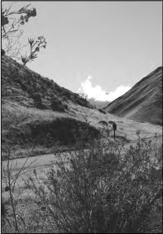
Below: One of the many trails guests may explore at the preserve.