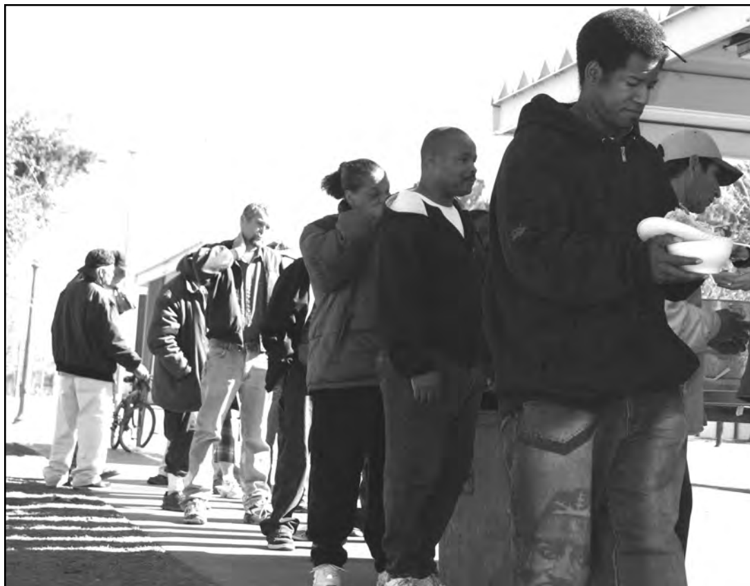
Some of the beneficiaries of the Food Not Bombs movement.

Using food as a direct protest to violence, poverty and war, this revolutionary organization strives to unite people