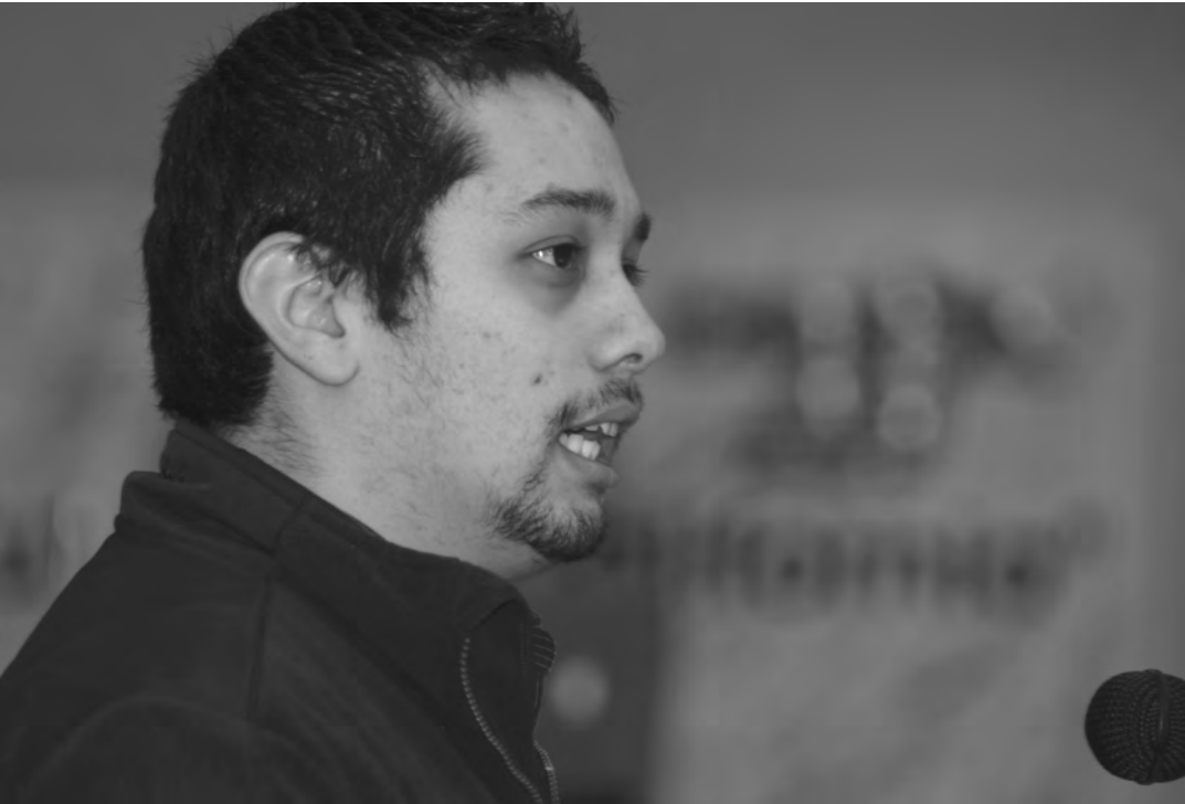
Above is the Sacramento State student body president. He spoke on how important funding is and that students are being hindered and how the Capital (Sacramento legislators) needs to prioritize higher education.