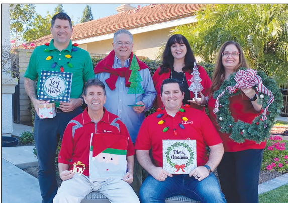
The Barlow Group DRE #01945712

Visit the 'Barlows Got Your Back' section of our website.