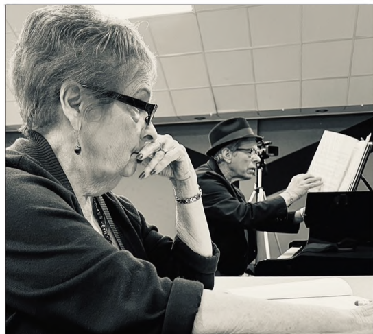
during the production of Damn Yankees.