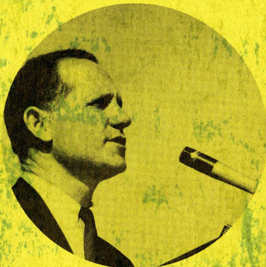
Lt. Gov. Anderson presiding over the California State Senate — "California cannot wait to meet its problems after they have become nightmares."

those who know him best urge the re-election of LT. Governor Glenn Anderson.