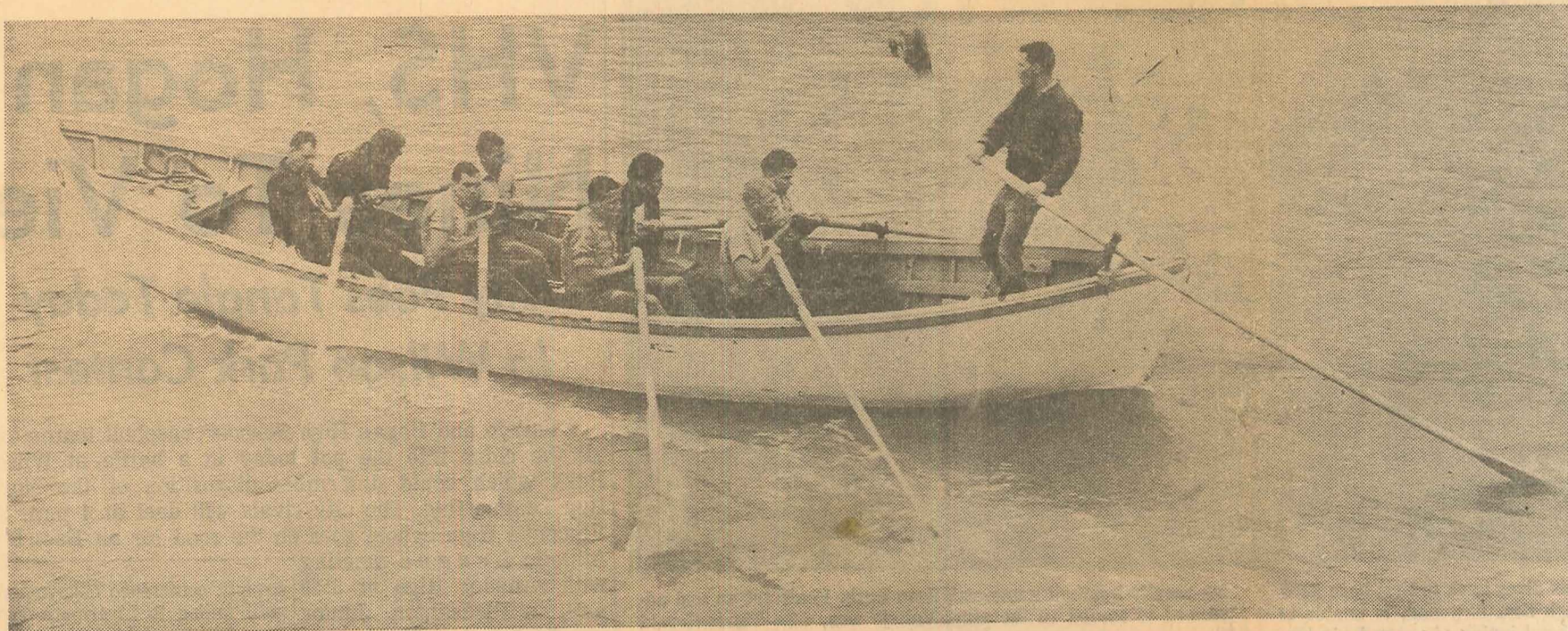
There'll be whaleboat racing on San Francisco Bay Saturday, and the California Maritime Academy will be represented with a squad in the Mari-

time Day competition off Aquatic Park. The CMA team will row in the Propeller Club Trophy Race. Here the CMA squad is pictured taking a workout