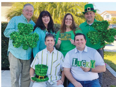
The Barlow Group BRE #01945712