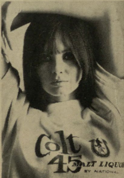
©The National Brewing Co. of Balto., Md. at Balto., Md. also Phoenix • Miami • Detroit