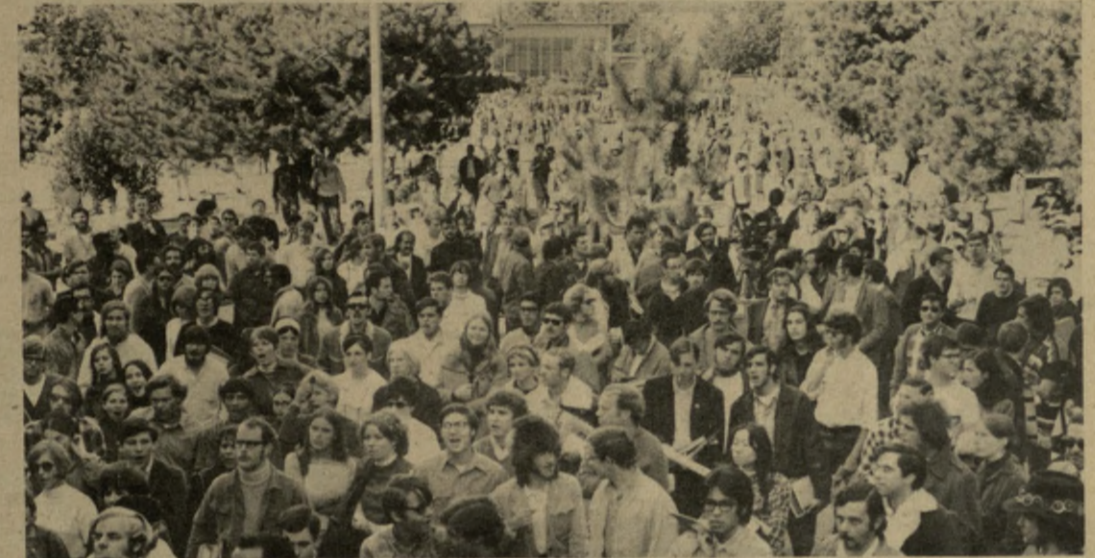
Group of radicals "marching on" the Ad Building yesterday at noon.

The TWLF also added its own demands and vowed to