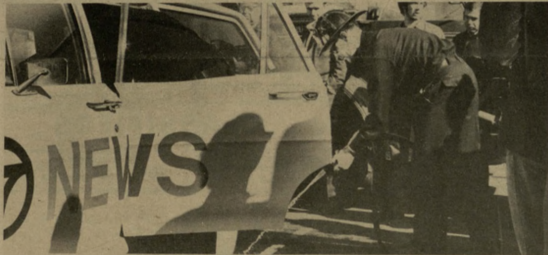
Firemen extinguishing flame in KGO station wagon.

Amid the campus turmoil, the SDS Labor Committee voted unanimously to picket (Continued on Page 2)