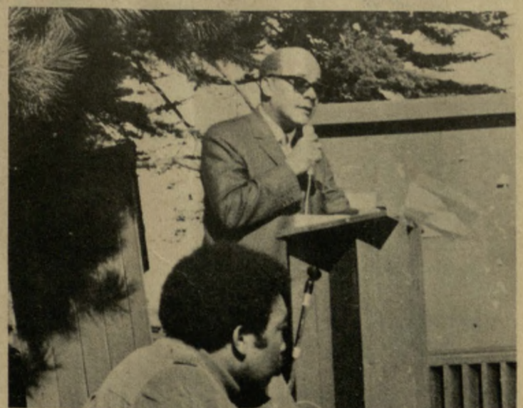
Novelist John O. Killens speaking on the role of the black writers

Killens was sponsored by the College Lecture Series to speak in the Main Auditorium but he rescheduled his appearance to the Speaker's Platform "to be with the peo-