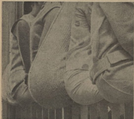
PLAYMATE INTERVIEW ... the room was overcrowded

The girls who appear in the (Continued on Page 3)