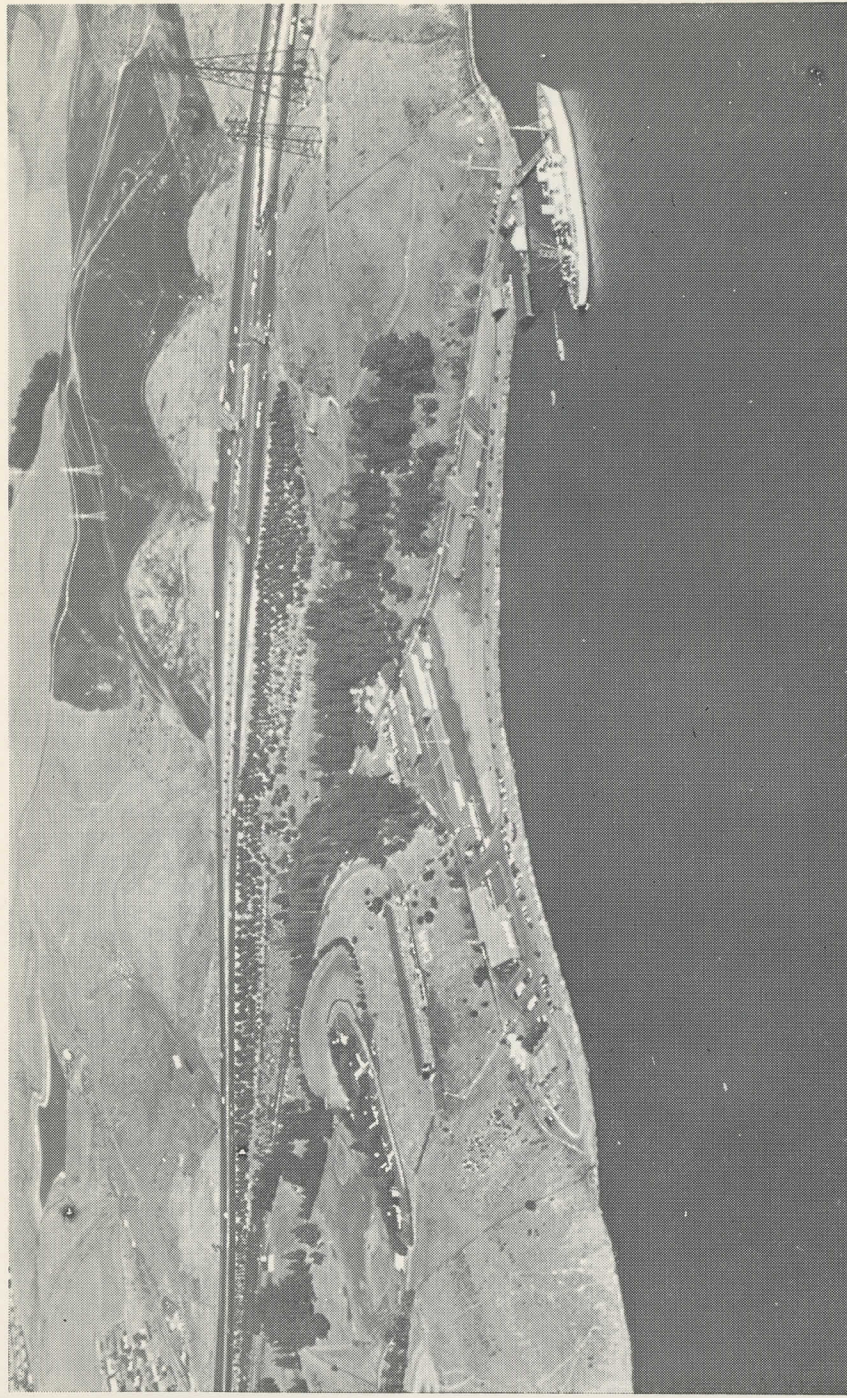
AERIAL VIEW OF THE CALIFORNIA MARITIME ACADEMY CAMPUS AND TRAINING SHIP "GOLDEN BEAR"