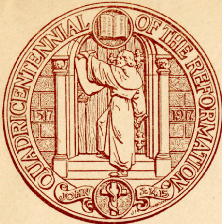
THE CELEBRATION MEDAL

QUADRICENTENNIAL OF THE REFORMATION 1517-1917 LUTHERAN HEADQUARTERS 925 CHESTNUT STREET PHILADELPHIA