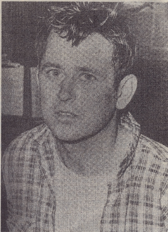
James Earl Ray at 30 years old.

COINTELPRO operatives discredited King by infiltrating black movements and turning