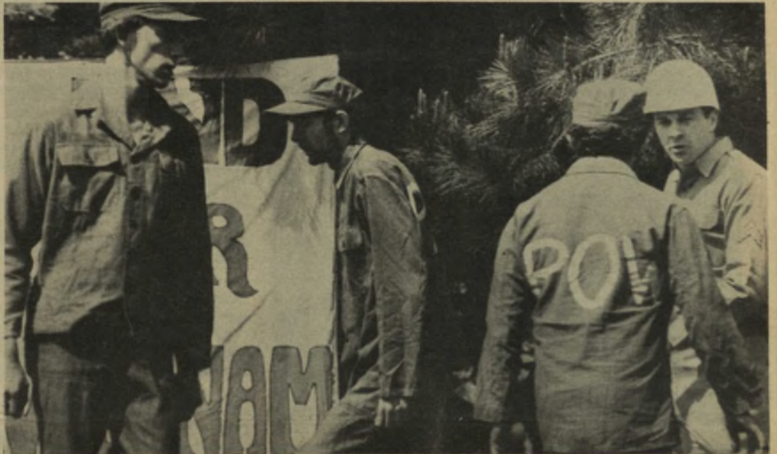
The SF Mime Troupe's version of a fascist prison guard harrasses POWs during a presentation of "The Man in the Center" at Friday's "teach-in" on the Speaker's Platform.

satirical novel entitled "Life with Lyndon," called protest "an immature thing to be doing."