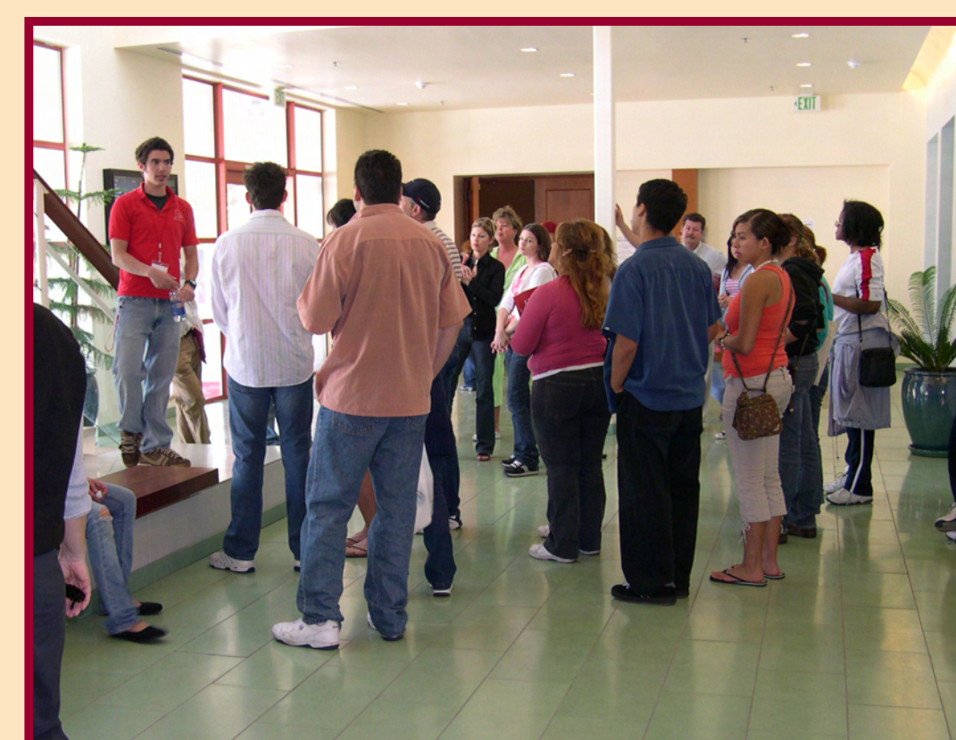
Visiting students receiving a campus tour

academic programs. Students can gain assistance in the admissions and application process. Discover CI is an annual spring event where applicants for the fall term attend workshop sessions profiling their academic program and receive information about the enrollment process. Attendees visit the university marketplace where they have a chance to interact with student clubs and organizations, various student services, and faculty. Counselors from our local area are invited to the campus for Counselor Day. Counselors have an opportunity to attend workshops that include admissions requirements, the housing process, and new academic programs. The program is an opportunity for counselors to network as well as be provided with resources to assist them with counseling students in applying to CSU Channel Islands.