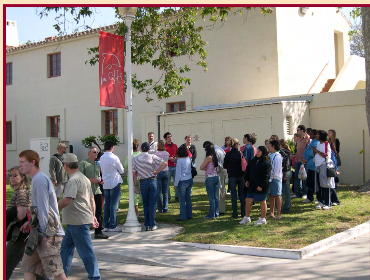
Admitted students and families attending Discover CI

2006/2007 Application Comparison during Priority Application Filing Period