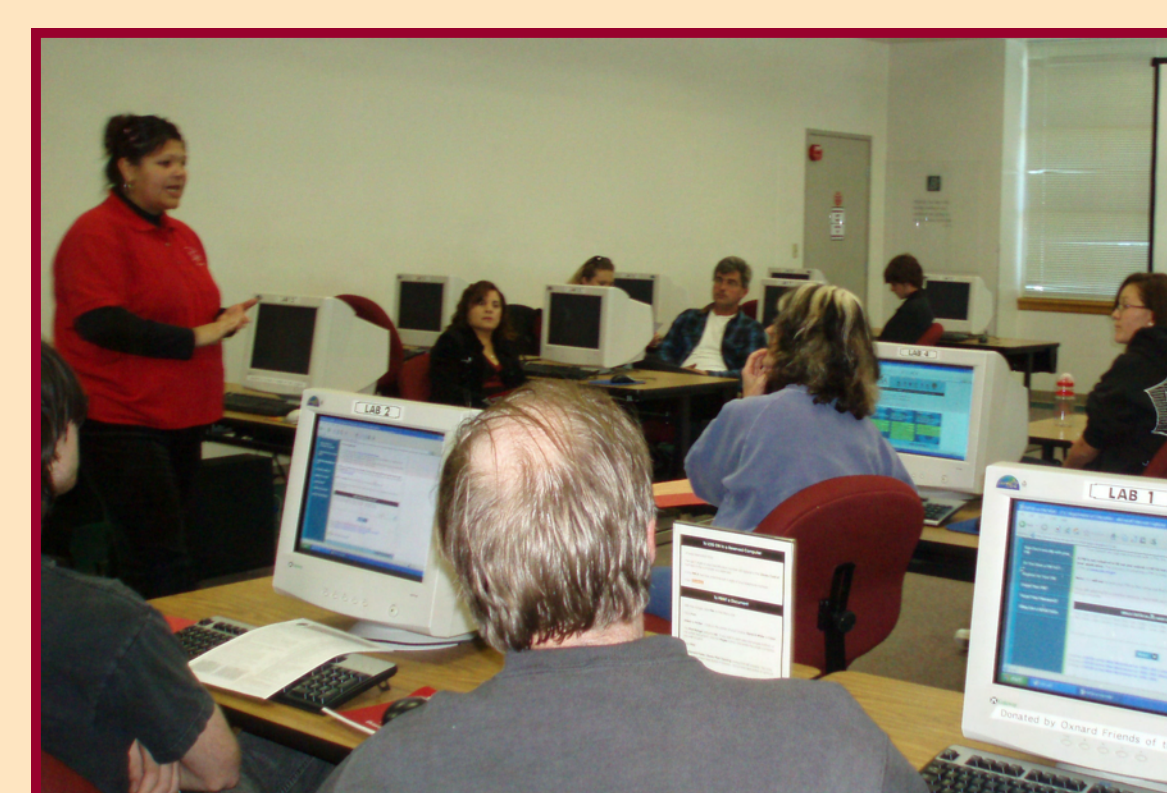
University Day at the Oxnard Public Library

In February 2006, Admissions & Recruitment partnered with the Financial Aid Office and the Oxnard Public Library to have University Day at the Oxnard Public Library. Fall 2006 applicants attended workshops at the library to assist with completing the Free Application for Federal Student Aid (FAFSA) form.