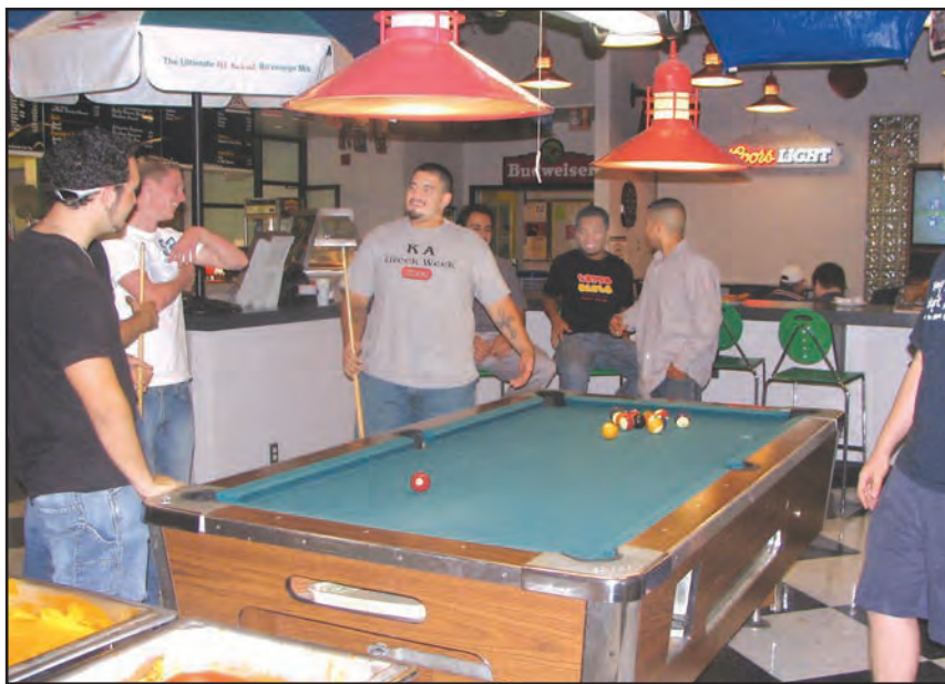
Students enjoy a little pool break while watching the game.

"It's the fall quarter and people are getting back to school, this is a good place to