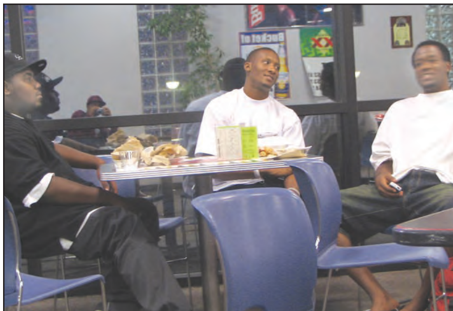
Students relax in the pub enjoying Monday Night Football playing on the big screen in Wiley's Pub

If you aren't much of a football fan, there are also a couple pool tables, and a lot of new people to meet.