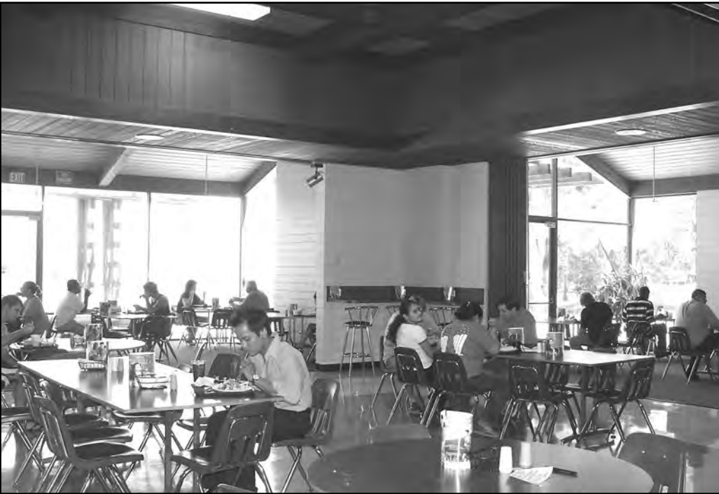
Students eating lunch in the Commons.

Monday-Friday $4.10 Continental Breakfast 7:00-7:30 A.M. Monday-Friday $4.10 Hot Breakfast 7:30-8:30 A.M. Monday-Thursday $5.00 Lunch 11:30 A.M.-1:30 P.M. Friday $5.00 Lunch 11:15 A.M.-1:15 P.M. Monday-Thursday $5.60 Dinner 5:00-7:00 P.M. Friday $5.60 Dinner 5:00-6:15 P.M. Saturday & Sunday $5.00 Brunch 10:30 A.M. -12:00 P.M. Saturday & Sunday $5.60 Dinner 5:00-6:15 P.M. Special Menu $7.50 To be Announced