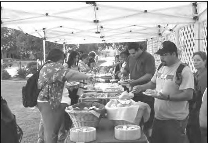
Students enjoy food at Thursday's Luau.

stage and participated along with the dancers. They danced to the song "Everybody Loves the Hookie Lounge."