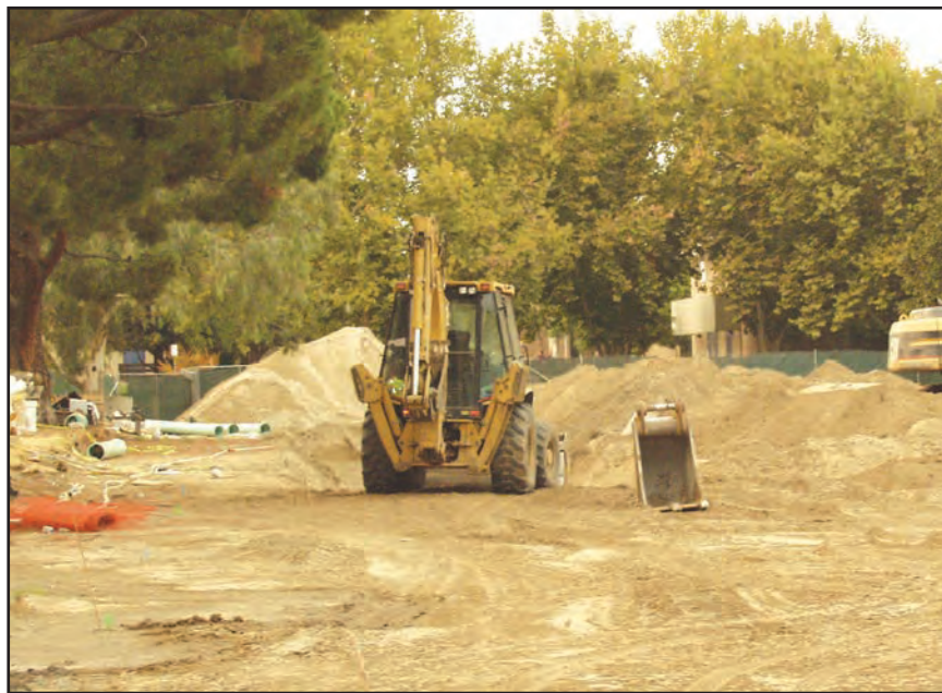
The site of the future math and science building

The expected date of completion of the building is Winter 2008, yet full use will likely occur in Fall of 2008.