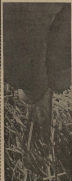
See page 2