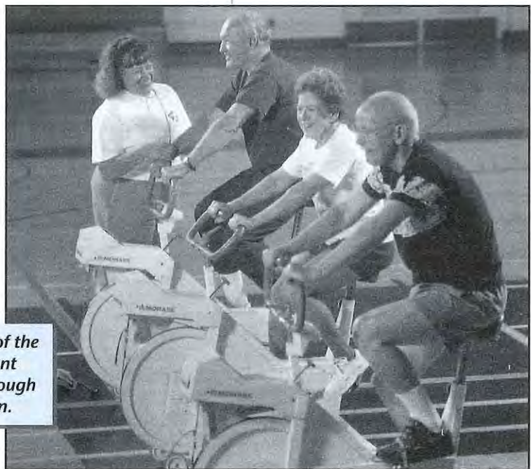
Eldercisers — one of the many life enrichment courses offered through Extended Education.