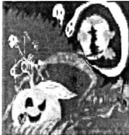
The Harvest Party is Oct 31, 2002 6:00 - 9:00 pm

Have plans for Halloween? Join us at the Hub for a Harvest Party !