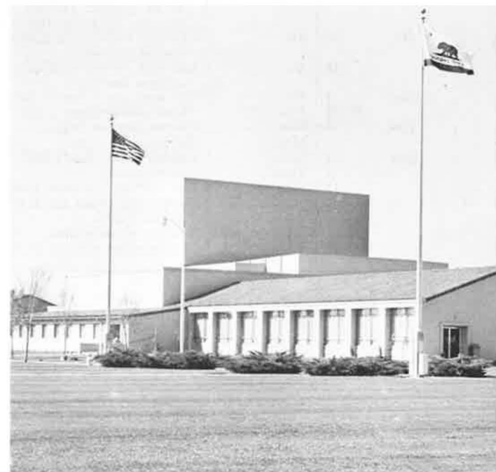
NOW — The United States and California flags fly proudly before the handsome new Speech Arts building on the Shaw Avenue campus. Construction was completed in the summer of 1960.