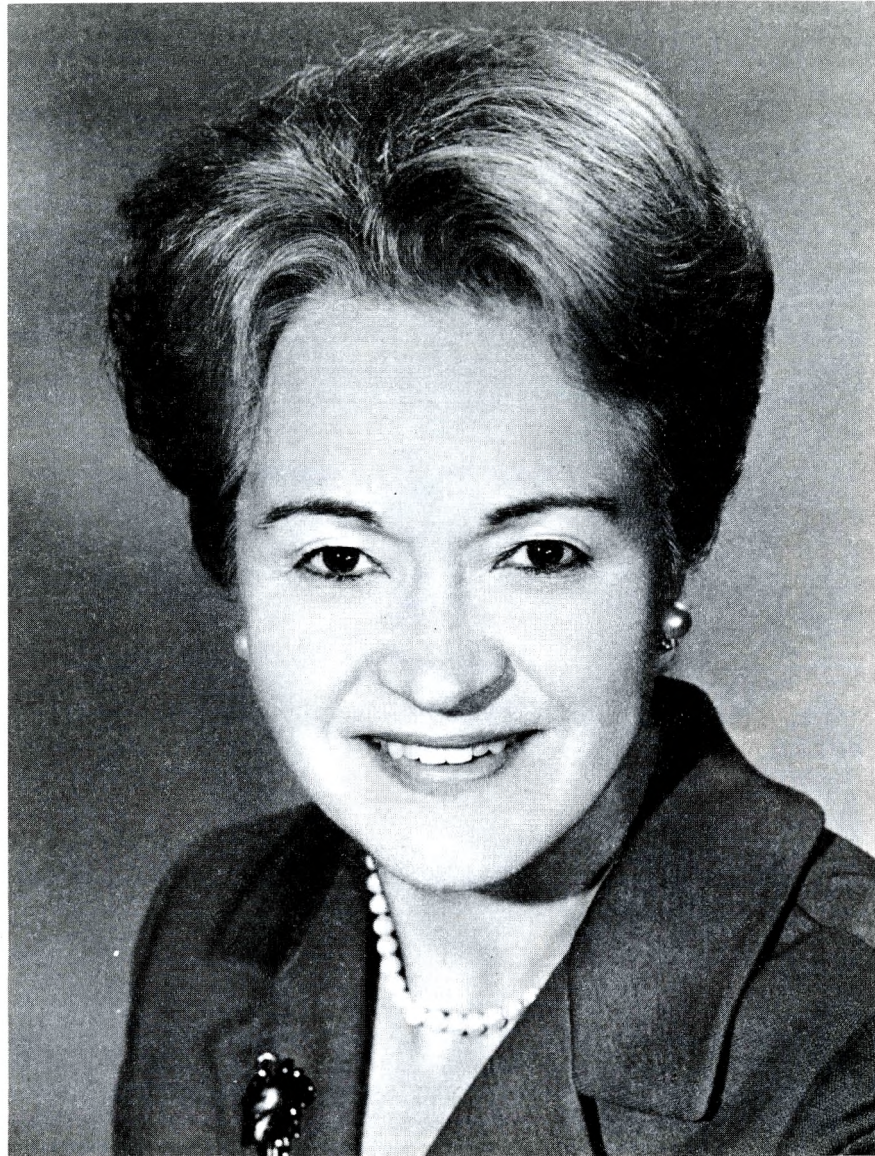
IVY BAKER PRIEST Treasurer