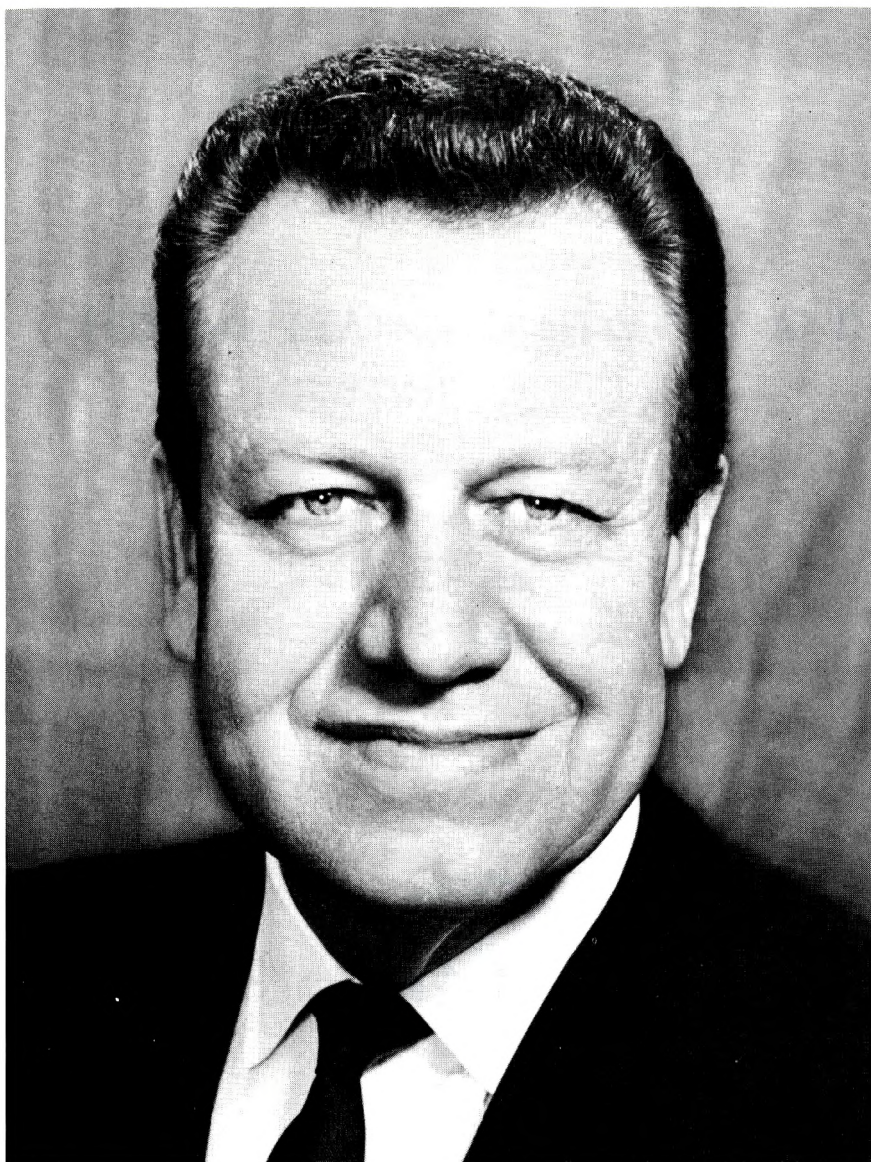
JESSE M. UNRUH Speaker, California Assembly