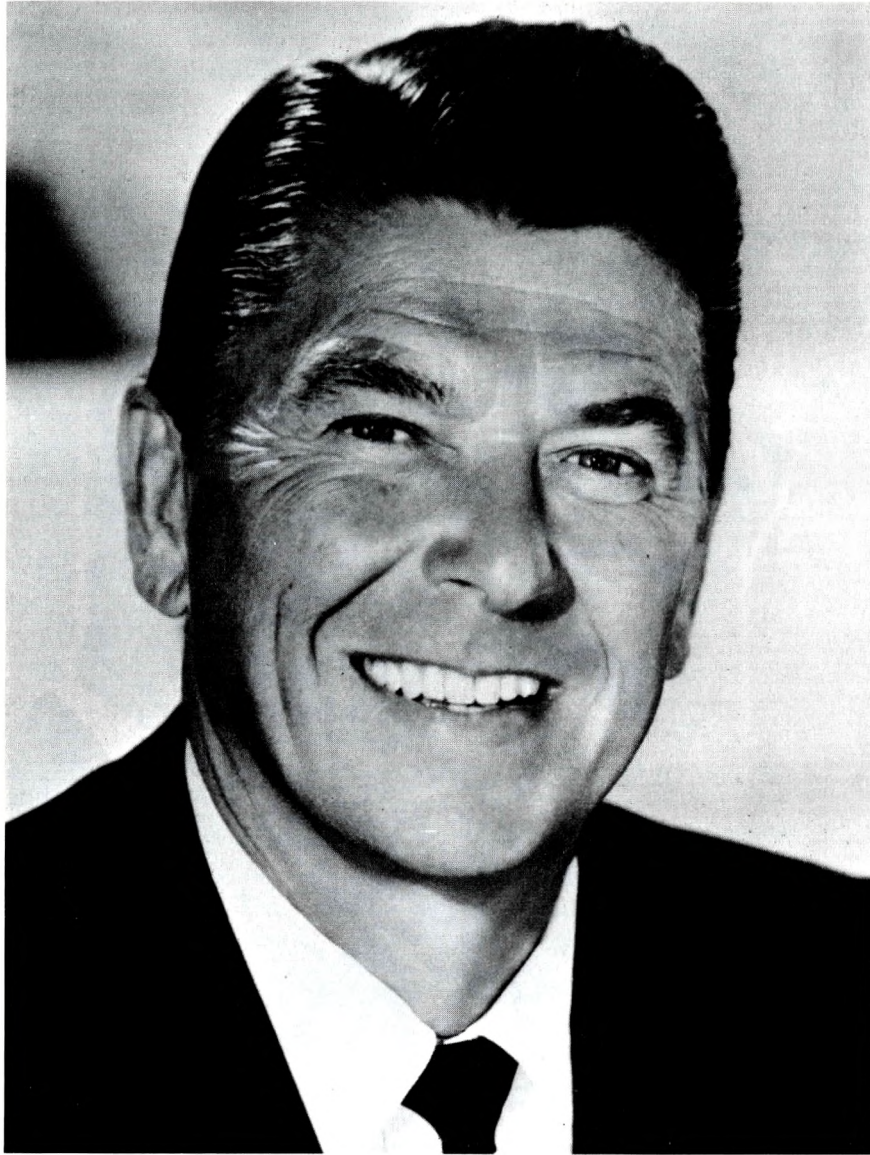
RONALD REAGAN Governor of California