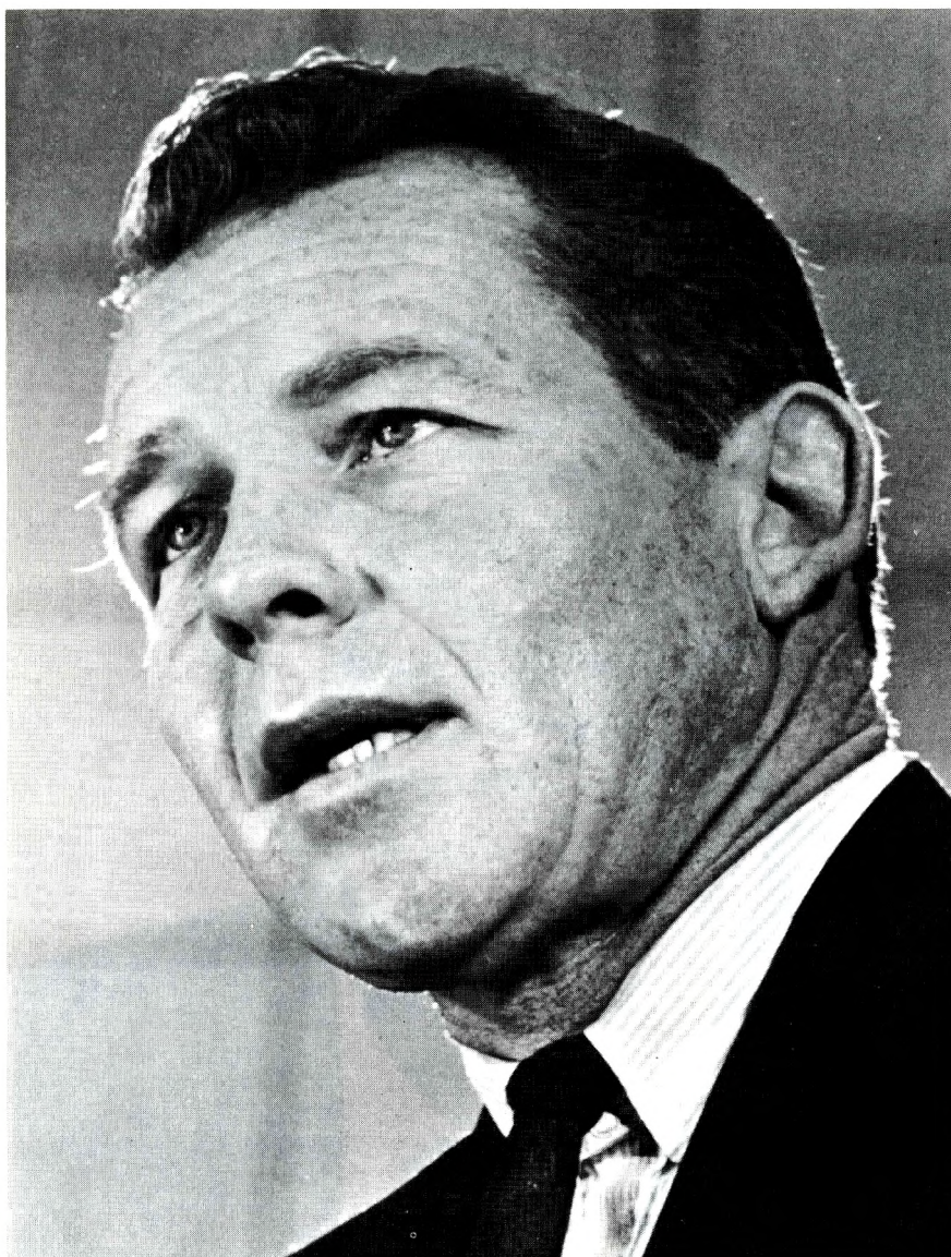
ROBERT H. FINCH Lieutenant Governor